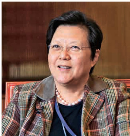
Rita Fan Hsu Lai-tai

Rita Fan Hsu Lai-tai, member of the NPC Standing Committee: Many people tend to give small bribes in order to get things done more quickly. Not long ago, according to a media report, a person working far away from his hometown had to apply for a birth certificate in his original place of residence. In order to obtain such a certificate, he went back to his hometown several times. However, each time, the local staff required different materials. In the end, he bribed the staff with 1,000 yuan and got the certificate immediately. This kind of deal is a common practice in