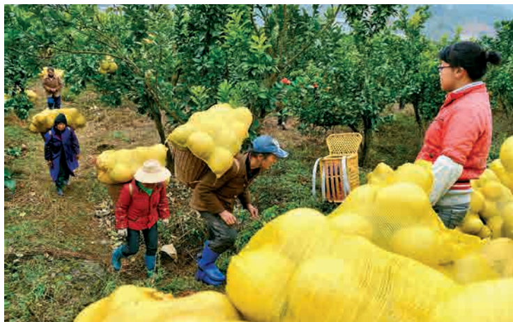
Farmers from Jiujiandian village in Xuan'en county, Hubei Province harvest white pomelos on November 27, 2013. Started from 2001, local departments of finance, forestation, agriculture and anti-poverty have assisted farmers to plant pomelos in order to increase their income. Statistics indicate that a total of 4,000 hectares are estimated to bring 250 million yuan income to local farmers. Tan Ling