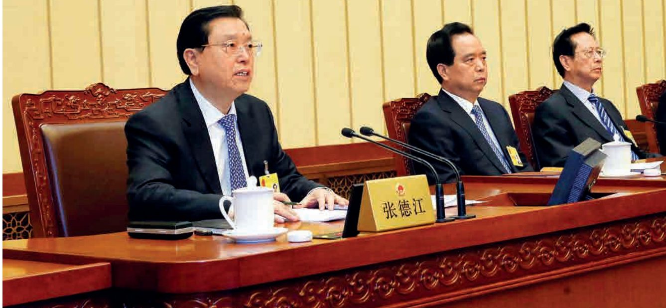
Zhang Dejiang (L), chairman of the Standing Committee of China's National People's Congress, presides over the closing meeting of the sixth session of the 12th NPC Standing Committee in Beijing on December 28, 2013. Liu Weibing

The Standing Committee of the National People's Congress (NPC) closed its bimonthly session on December 28, 2013, easing the one-child policy and abolishing the laojiao system (reeducation through labor).