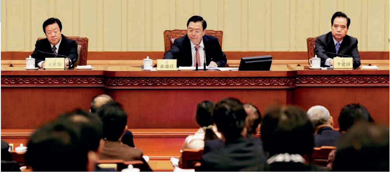
Presided by Chairman Zhang Dejiang, the 5th Meeting of the 12th NPC Standing Committee concluded on October 25, 2013 at the Great Hall of the People in Beijing. The meeting approved the amendments to Consumer Rights Protection Law and other resolutions.