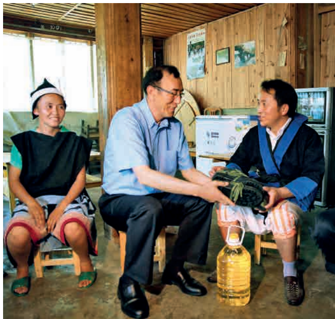
NPC Vice-Chairman Qiangba Puncog (C) visits villagers of Lapian village in Yaoshan township, Guizhou Province.

"The Party gave me a second life. Since then, my birthday is May 6," said Qiangba Puncog.