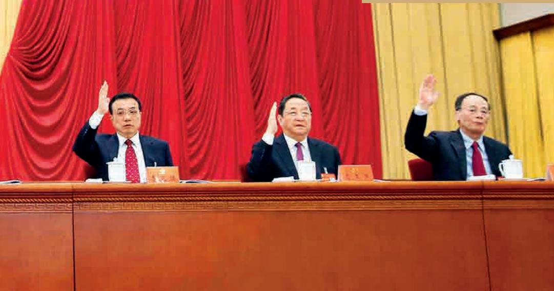
Top Chinese leaders Xi Jinping (C), Li Keqiang (3rd R), Zhang Dejiang (3th L), Yu Zhengsheng (2nd R), Liu Yunshan (2nd L), Wang Qishan (1st R), Zhang Gaoli (1st L) attend the Third Plenary Session of the 18th CPC Central Committee in Beijing on November 12, 2013. The session lasted from November 9 to 12.

“Reform and opening up” will decide the destiny of modern China, and will be key to ensuring the country adapt to a rapidly changing world.