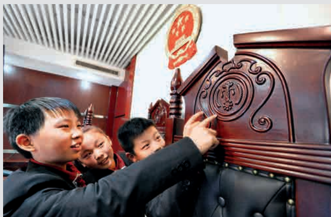
A primary student school explains the meanings of a logo of a balance to his classmates on December 3, 2013 in Handan, Hebei Province. Accompanied by judges, students from Qinhe Primary School visited Congtai District People's Court.

Making the judicial system be more transparent. Record and keep all court files. Strictly regulate procedures of sen-