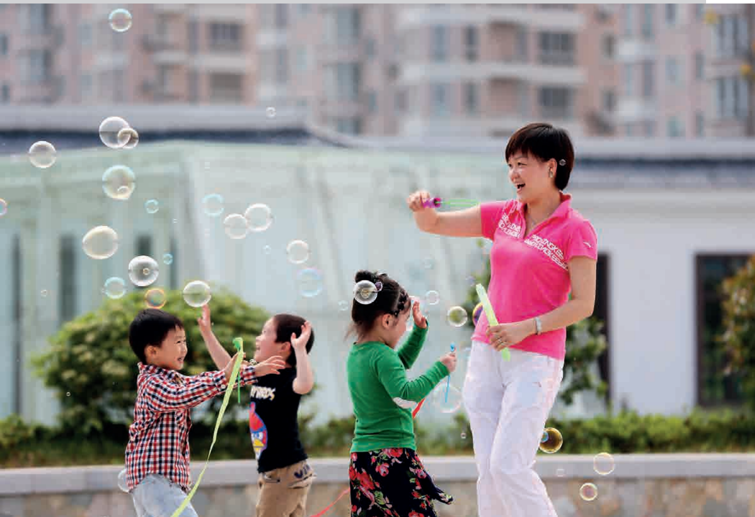
Under the guidance of a teacher, some kids blow bubbles at Yangfushan Park in Wenzhou, Zhejiang Province on April 26, 2012. A spring outing has brought great joy to the kids.