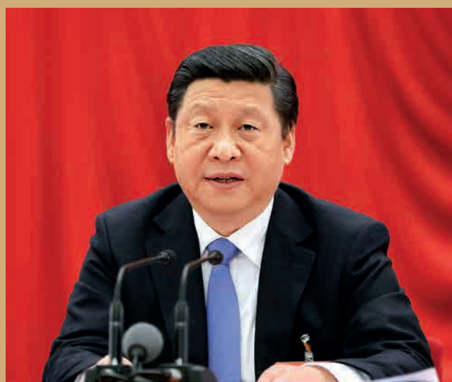
Xi Jinping, general secretary of the Communist Party of China (CPC) Central Committee, addresses at the Third Plenary Session of the 18th CPC Central Committee in Beijing on November 12, 2013. Lan Hongguang