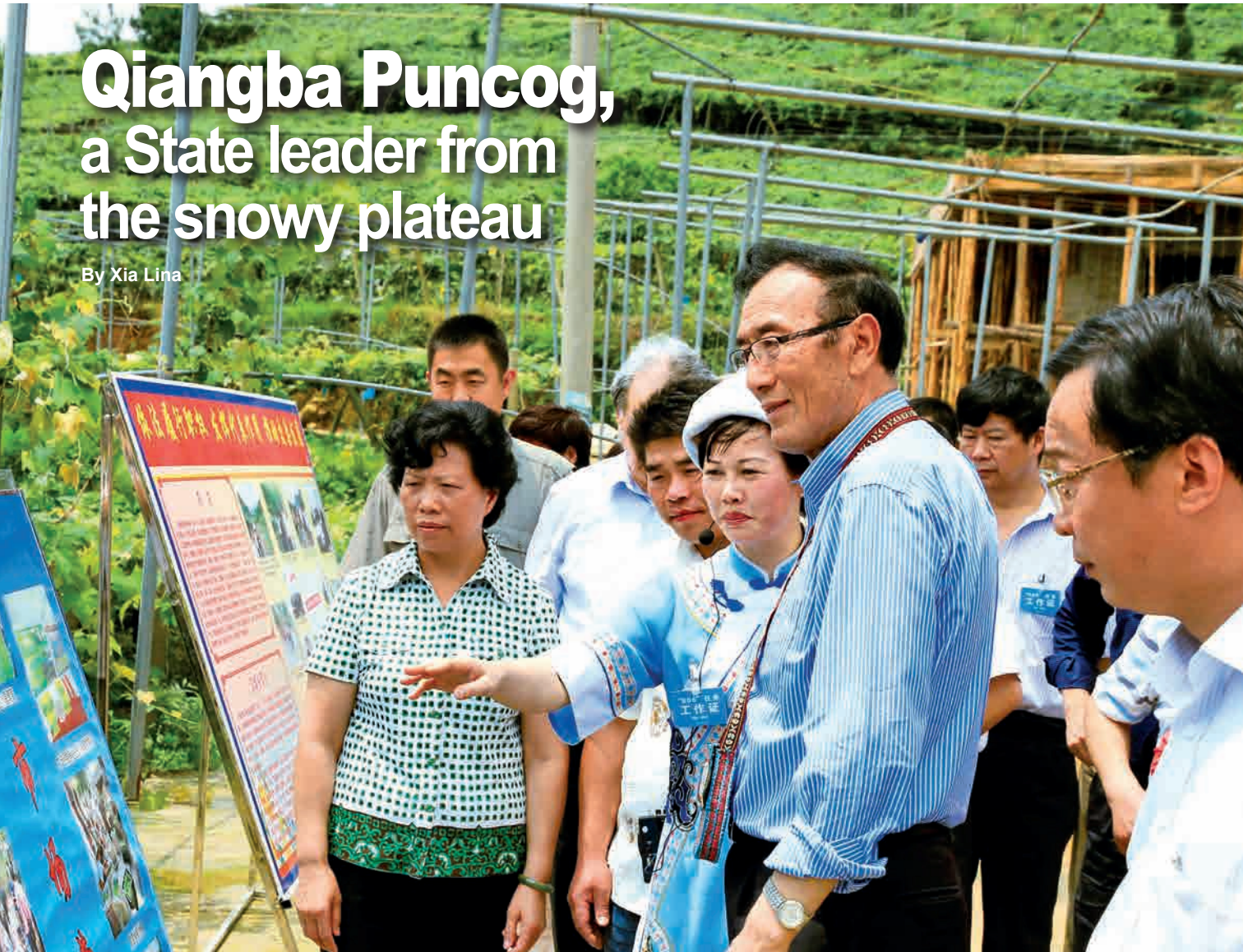
NPC Vice-Chairman Qiangba Puncog (2nd R) visits Yaoren National Forest Protection Zone in Sandu Shui Autonomous County in Guizhou Province.

B ack to August, 2010 when he was the chairman of the Standing Committee of Tibet People's Congress, Qiangba Puncog sat with me in a two-hour interview, wearing dark blue suit, blue oblique stripe tie and light brown glasses on his high nose. Being tall and thin with clear facial outline, he was a man of charisma. He spoke fluent mandarin with gentle tone and unadorned words. Being learned, pragmatic, and calm, he impressed me a lot.