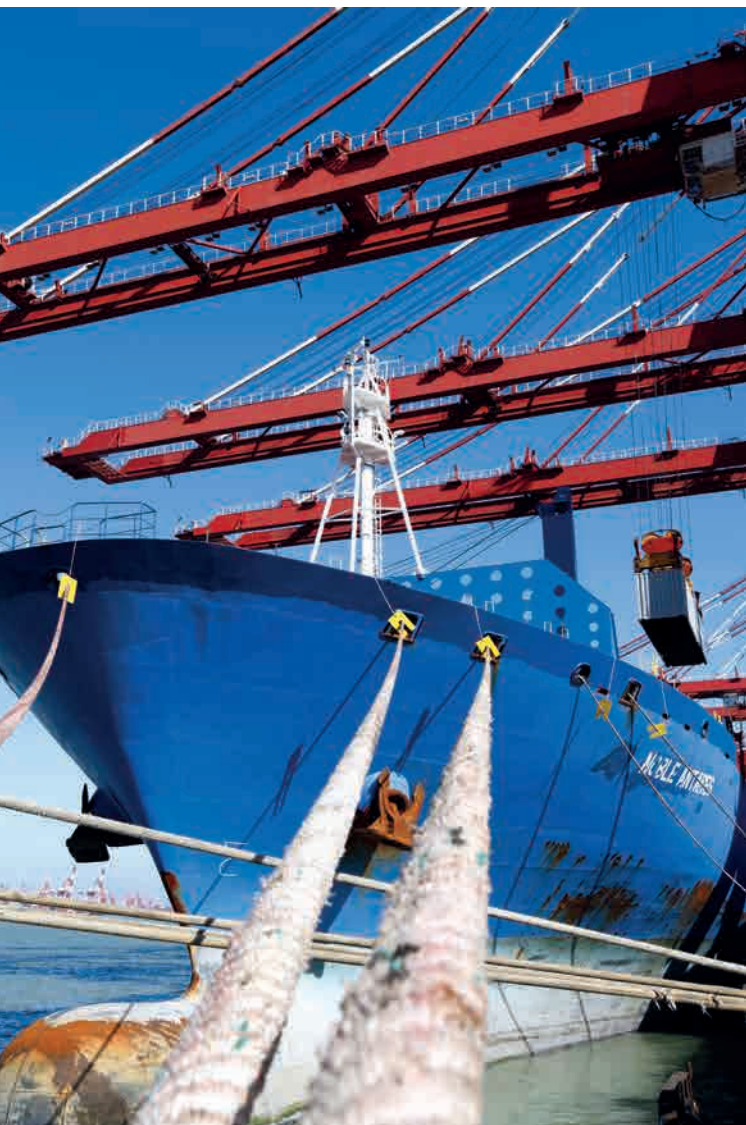
The picture taken on November 7, 2013 shows the container dock of Qingdao Port, Shandong Province. Qingdao Port ranks No. 7 of the world in its incoming and outgoing freights. Li Ziheng

The session says the Communist Party should make its leadership more scientific and democratic. The Party must also be in the vanguard and clean to provide political support for opening-up and socialist modernization.