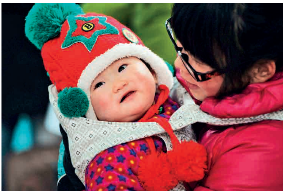
A picture taken on January 26, 2013 shows a mother and a newborn baby in Qingdao, Shandong Province.