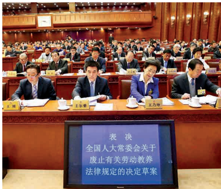
The 6th Meeting of the 12th NPC Standing Committee concluded at the Great Hall of the People on December 28, 2013. The meeting approved the abolition of the regulations and laws on labor-education system.

The participating members believe that laojiao played a very important role in educating and rehabilitating those who had broken laws and jeopardized social security, safeguarding public security, and ensuring social stability since its implementation more than 50 years ago. Alongside the enforcement of the Anti-Drug Law, the Law on Public Security Management and Punishment, and also the amendment of Criminal Law, we could properly punish and educate those