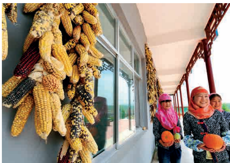
Waitresses from a farmer's hotel in Yejia village in Jingyuan county, Ningxia Hui Autonomous Region welcome tourists on June 10, 2012. Jointly approved by the China National Tourism Administration and State Council Poverty Alleviation and Development Office, Liupanshan established a pilot anti-poverty zone through the development of tourism.