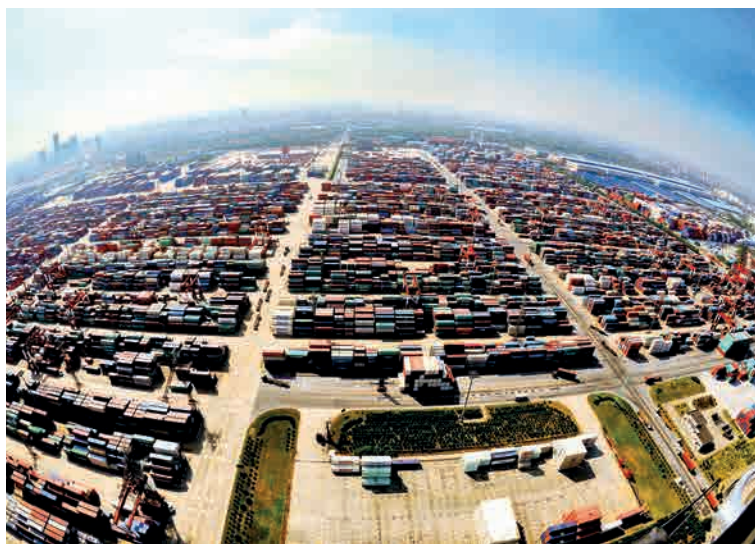
A photo taken from a patrol helicopter on October 29, 2013 shows the bird's-eye view of Waigaoqiao Container Port of Shanghai Pilot Free Trade Zone. Fan Jun

The session calls on all Party members to unite closely around the CPC Central Committee with Xi Jinping as the General Secretary. Together they will write a new chapter for China's reform and opening up, build a moderately prosperous society, achieve new victories in building a socialist country with Chinese characteristics and achieve the China Dream of rejuvenating the great Chinese nation. (Xinhua) ■