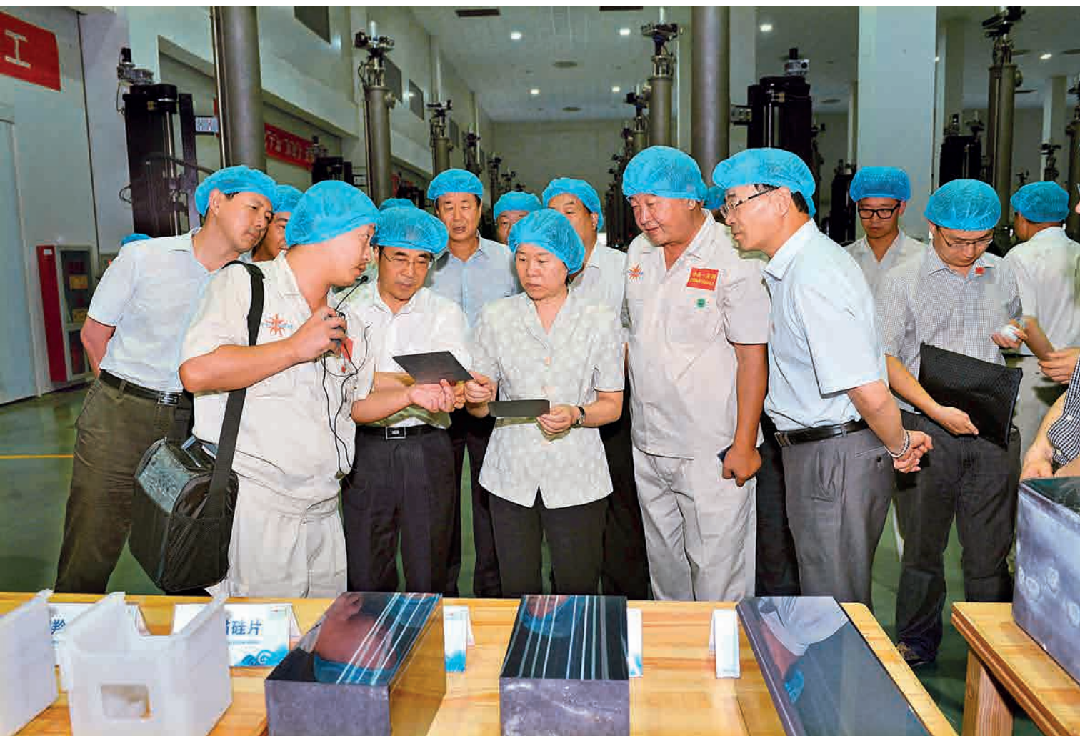
Headed by Vice-Chairwoman of NPC Standing Committee Shen Yueyue (C), an NPC inspection team visit Yingli New Energy Company in Baoding, Hebei Province on July 26, 2013. The team conducted special investigations in Shijiazhuang, Xingtai and Baoding in Hebei Province.