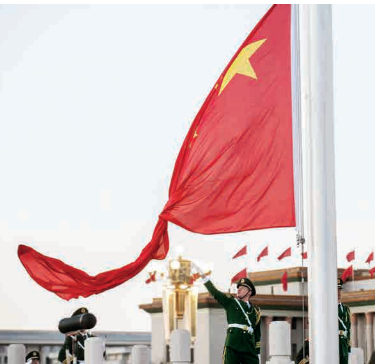
A flag-raising ceremony is held at the Tiananmen Square in Beijing. Zhang Yu