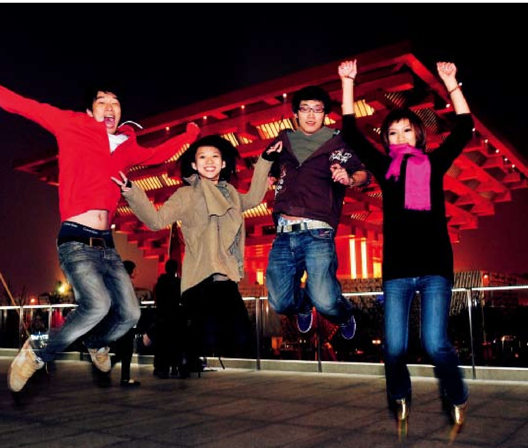
The Shanghai World Expo 2010 closes on October 31, 2010. Four Chinese young men and women had photos taken in front of the China National Pavilion.