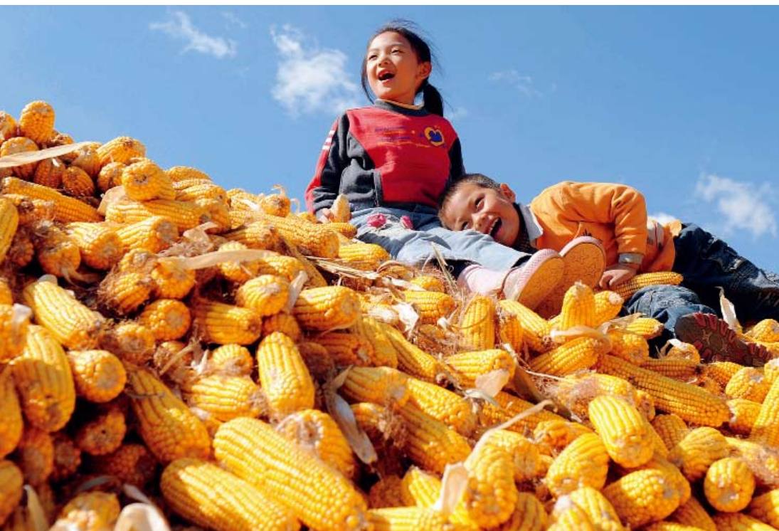
Two children play corns at Dongsheng village, Suihua city, Heilongjiang Province.

disasters caused by prolonged low temperatures, icy rain and heavy snow and the violent earthquakes in Wenchuan, Sichuan Province and Yushu, Qinghai Province. The rising grain production has played an important and fundamental role in preserving a stable and relatively rapid economic growth and a stable and harmonious society.