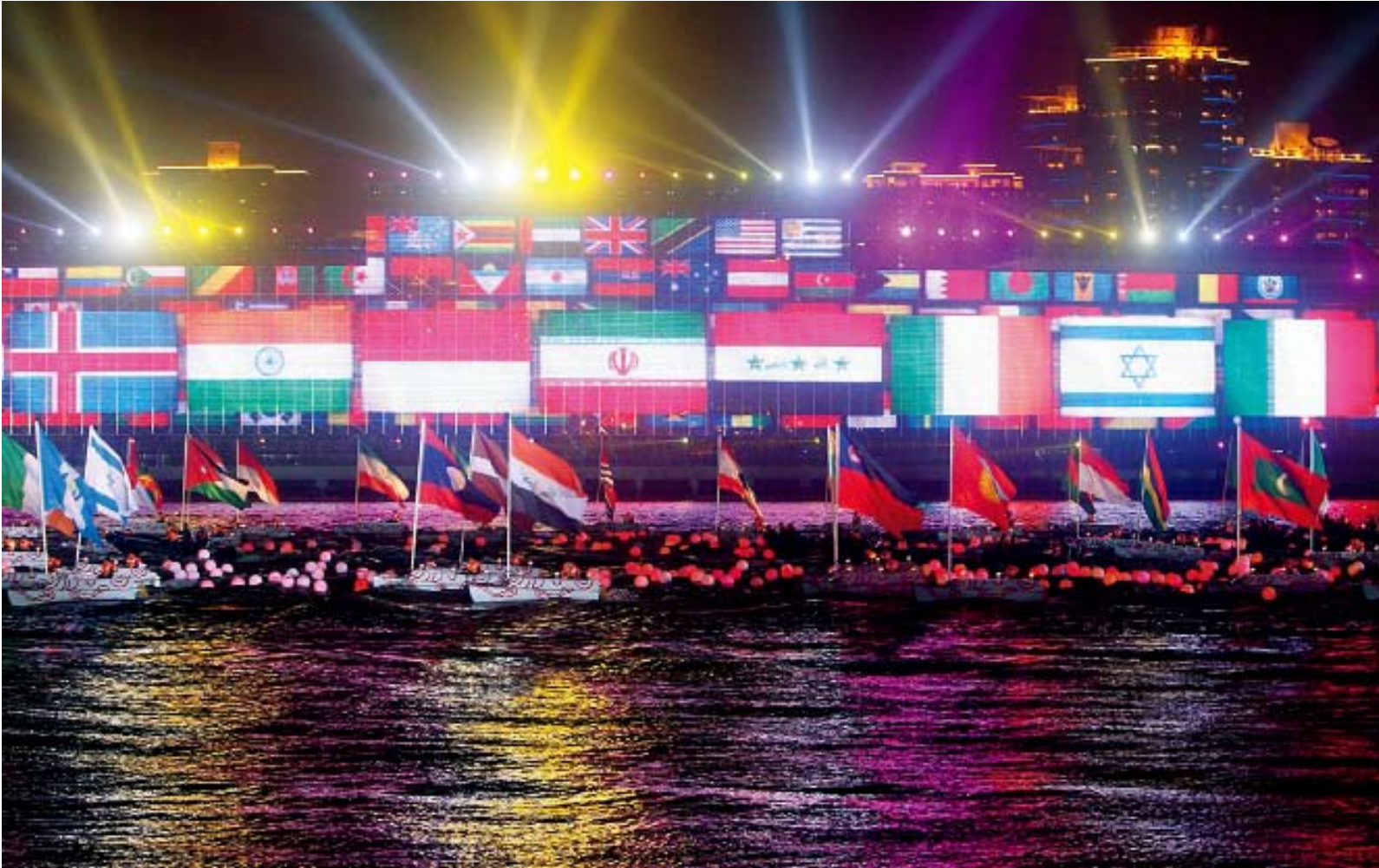
A firework performance follows the opening ceremony of the Shanghai Expo 2010 on the evening of April 30.

future innovations, was delivered during the closing plenary.