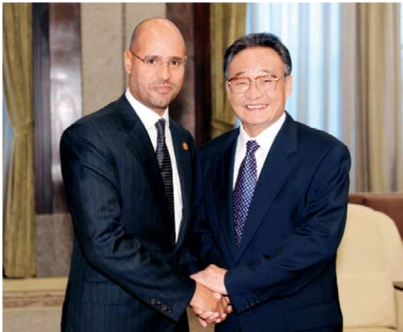
On October 1, 2010, Wu Bangguo, chairman of the Standing Committee of NPC meets Mr. Seif al-Islam Gaddafi, chairman of the Gaddafi International Charity and Development Foundation, who came to China to attend the celebration of China National Pavilion Day at Shanghai Xijiao Hotel.

him. Since the two countries resumed diplomatic relations in 1998, bilateral links have been growing rapidly with profound achievements in various areas, said Wu.