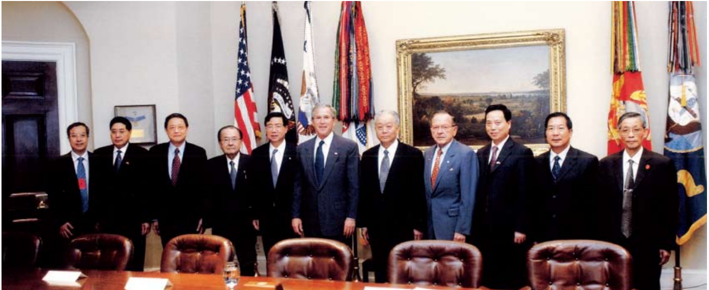
The then US President George W. Bush, accompanied by Mr. Stevens (4th from the right) and Daniel Ken Inouye (4th from the left), meets NPC Standing Committee Vice-Chairman Sheng Huaren in June 2005.

Chairman Sheng Huaren arranged and accompanied Stevens to visit Nanjing Anti-Japanese Martyrs' Museum and Nanjing Monument to the Aviator Martyrs. The unique museum registered the brave deeds of pilots from China, United States and Soviet Union fighting together against Japanese armies in China during the World War II. Names of 3,304 martyrs, including the members of "Flying Tigers", are carved on the monument standing on top of the cemetery. Stevens laid a wreath at the monument, on which it said "In honor of General Chennault and the 14th Air Force – Flying Tigers – and all those who sacrificed their lives in the resistance war against the Japanese invasion."