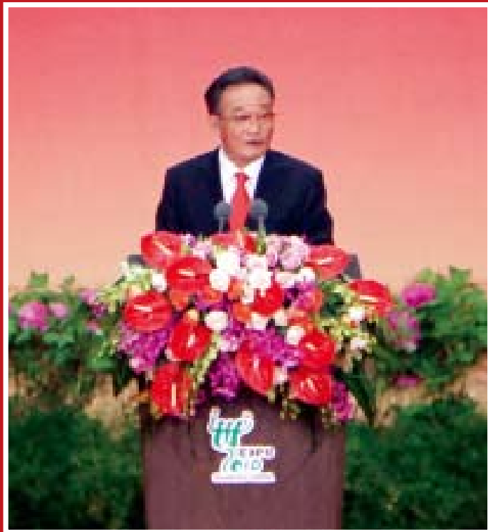
NPC Standing Committee Chairman Wu Bangguo participates and delivers a speech at the ceremony for the China National Pavilion Day at the Shanghai Expo on October 1.