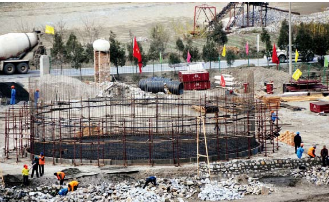
Reconstruction projects go smoothly in Zhouqu after the devastating mudslide. The picture taken on November 17 shows one of the two 800-cubic-meter water tanks. Song Changqing