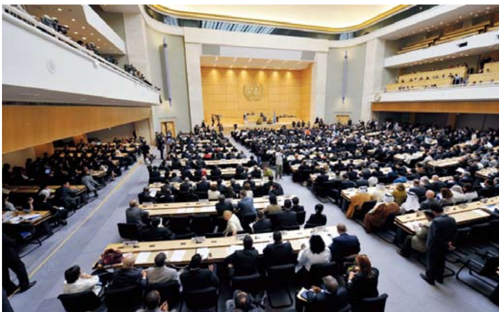
The 3rd World Conference of Speakers of Parliaments kicks off at the Palais des Nations in Geneva on July 19. Yu Yang

Parliamentary exchanges make an important part of international relations. Parliamentary exchanges