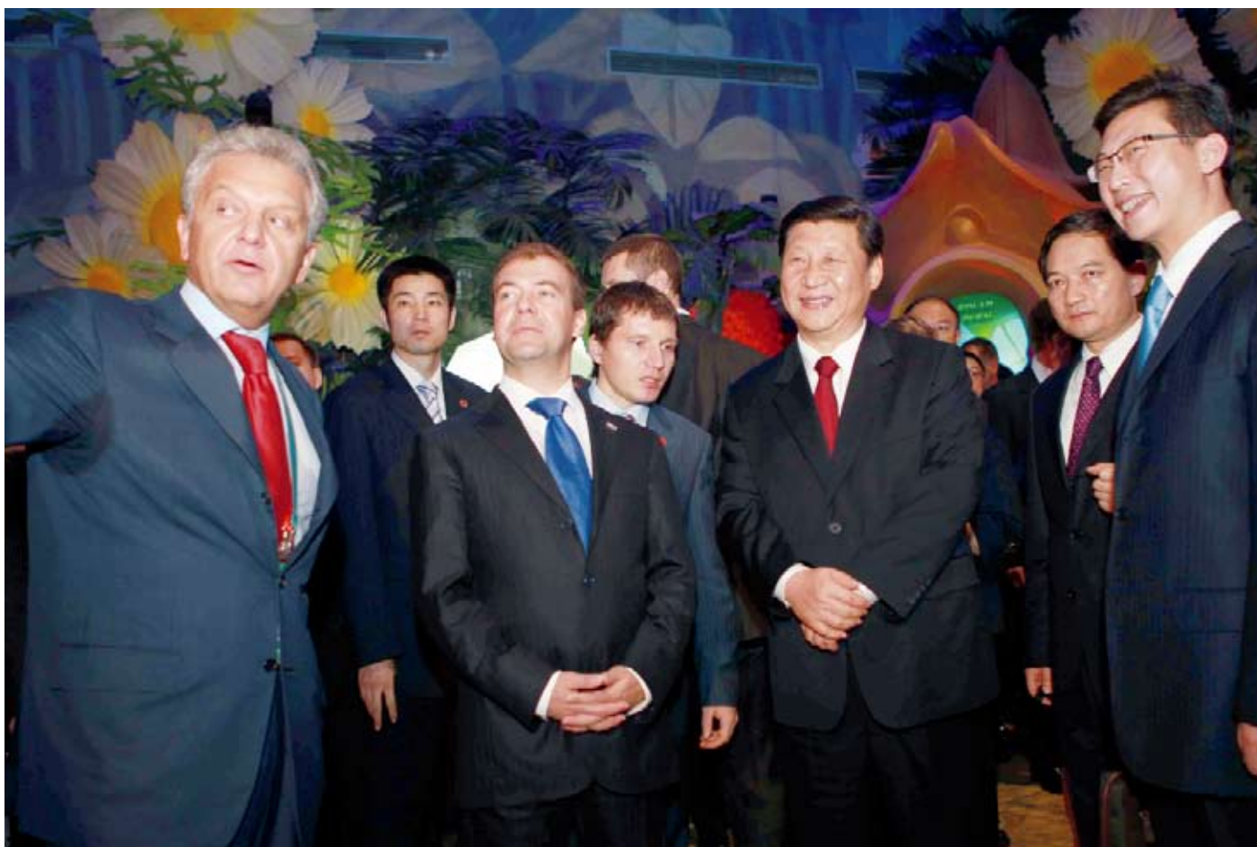
On September 28, Vice President Xi Jinping and Russian President Dmitry Medvedev attend the celebrations for the Russia National Pavilion Day and visit the Russian National Pavilion at Shanghai World Expo.

C hinese President Hu Jintao and other top leaders toured the World Expo site during the May Day holiday and reminded Shanghai organizers to ensure safety and quality services throughout the six-month event.