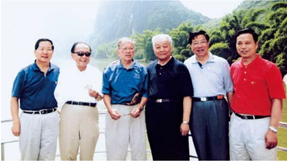
Participants attending the Sino-US parliament meeting pay a visit to Lijiang River, Guangxi Zhuang Autonomous Region in August, 2006.

will be a historic event, and be warmly received by the people of both countries. As time goes on, all of us will become part of the history.”