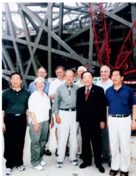
Mr. Stevens (3rd from the right), Daniel Ken Inouye (2nd from the left) and other US visitors pay a visit to the Bird's Nest – the National Stadium – which was still under construction.

in the US, Stevens had a mammoth influence on US' China policy. He played a positive role in the establishment of Sino-US diplomatic relation, supported to grant Most-Favored-Nation treatment to China and to build permanent normal trade relations with China. Moreover, he supported China's bidding of the Beijing Olympic Games and Shanghai World Expo, opposed the senate to pass a groundless amendment to criticize China's human right condition. Besides, he worked hard to build the exchange mechanism between Senate of US