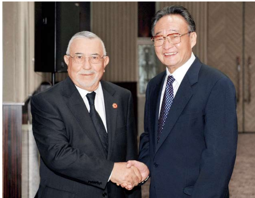
On October 1, 2010, Wu Bangguo, chairman of the Standing Committee of NPC meets Mr. Abdelwahed Radi, speaker of the House of Representatives of Morocco, who came to China to attend the celebration of China National Pavilion Day at Shanghai Xijiao Hotel.

China hopes the tradition can be maintained, bringing closer cooperation between parliamentary leaders, special committees and panels to share governance experiences and promote economic cooperation, said Wu.