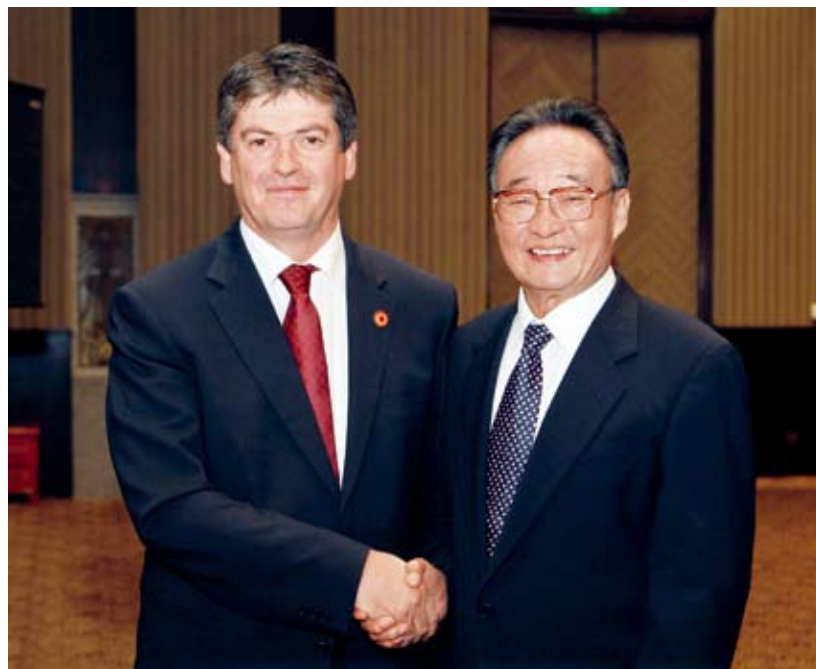
On October 1, NPC Chairman Wu Bangguo meets the Albanian President Bamir Topi who participated in the celebrations of the China National Pavilion Day.