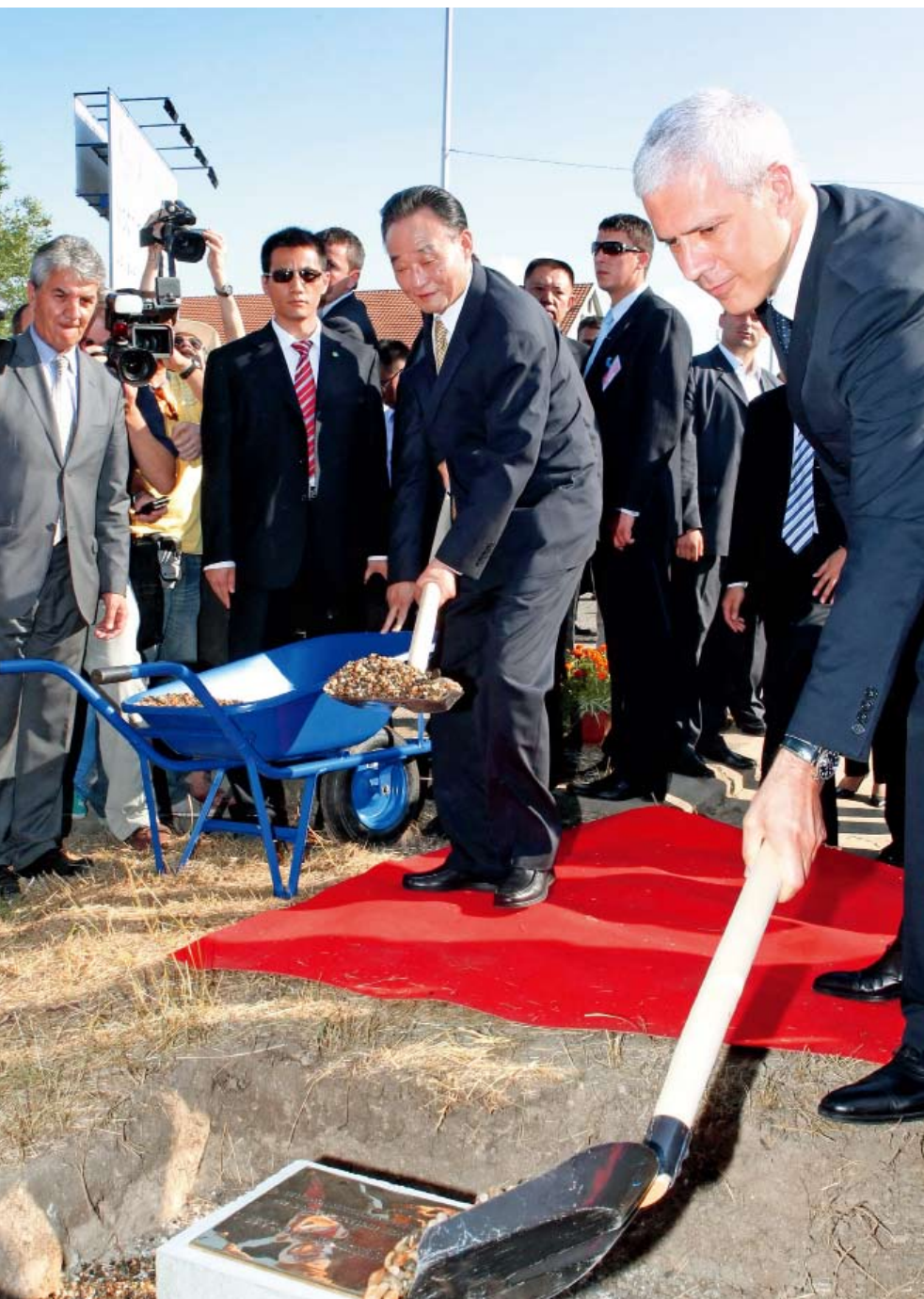
Wu Bangguo, chairman of the NPC Standing Committee attends the ground breaking ceremony of Zemun Belgrade - Boer Cha bridge across the Danube in Belgrade on July 14. He also delivers a speech at the ceremony.

The top legislator spent a lot of time elaborating on the potential for international economic cooperation during every stop of his visit.