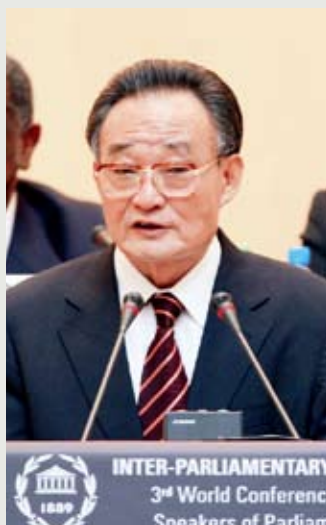
Wu Bangguo, chairman of the NPC Standing Committee, attends the opening ceremony of the 3rd World Conference of Speakers of Parliaments and delivers a speech in Geneva on July 19. Ju Peng

First, strengthen confidence. Confidence is the premise of realizing the MDGs. The MDGs, which include goals in 8 aspects to eradicate extreme poverty and hunger, to achieve universal primary education, to promote gender equality and empower women, to reduce child mortality, to improve maternal health, to combat diseases, to ensure environmental sustainability and to develop a global partnership for development, embody the basic demand of people and reflect the fundamental human rights. To fulfill the MDGs is a solemn pledge of the international community, an important measure to uphold dignity, equality and fairness of mankind, and the most urgent and important issue that needs to be addressed. The global financial crisis has an impact that can not be neglected on the MDGs, but the world should be aware that the implementation of MDGs is beneficial to the recovery of world economy and