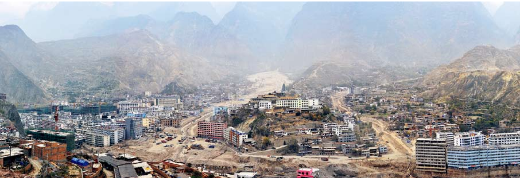
A bird's-eye view of Zhouqu, Gansu Province on November 13. November 15 marked the 100th day after the Zhouqu mudslide that engulfed hundreds of people.