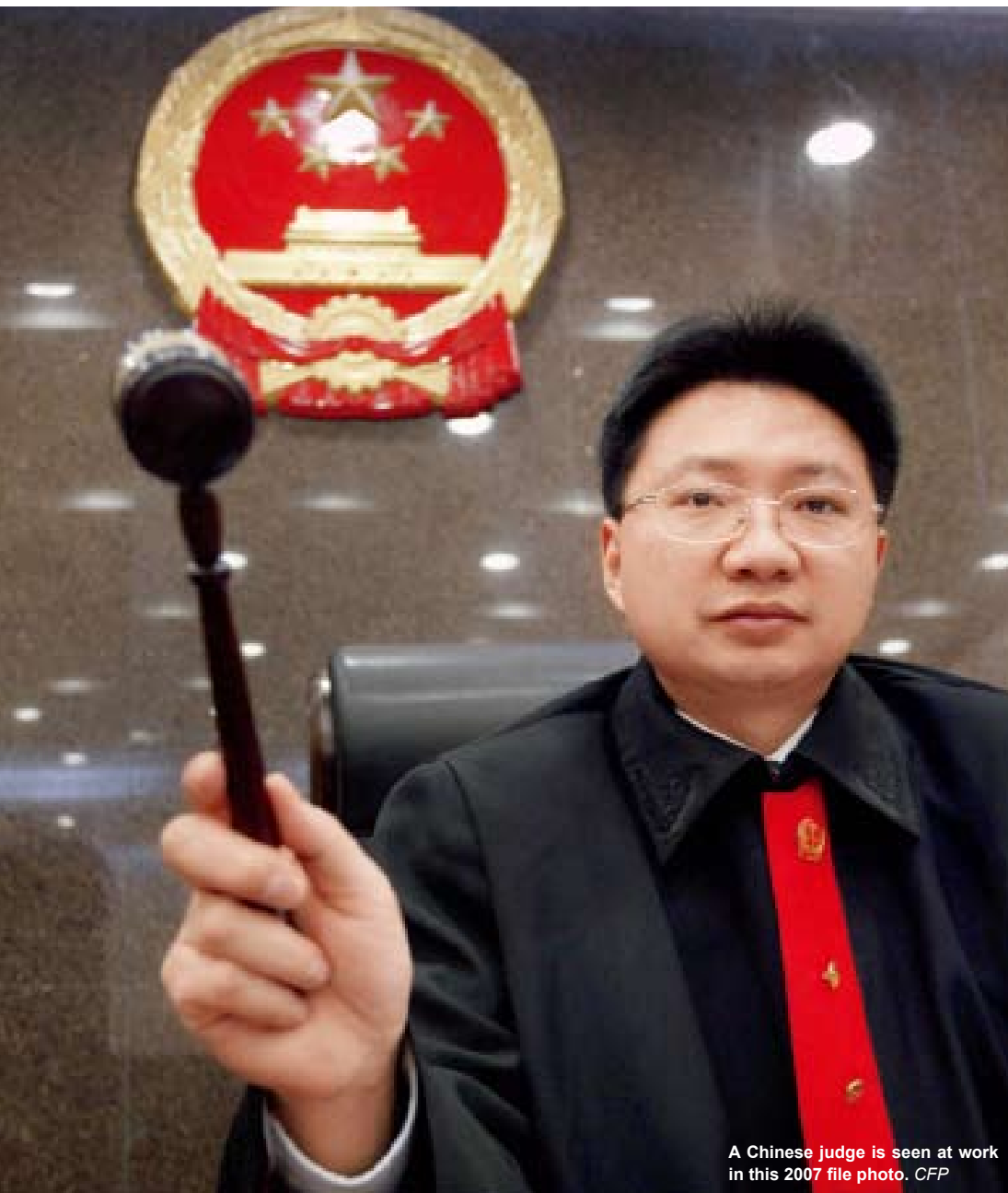
A Chinese judge is seen at work in this 2007 file photo.

The current Criminal Law in China stipulates that 68 out of more than 480 crimes can invoke the death penalty, which makes the nation one of the countries with the widest scope of the capital punishment. However, harsh penalties are not part of China's tradition in the aspect of the criminal laws. Instead, the view of being cautious with penalties has dominated China's legal tradition since it had written records.