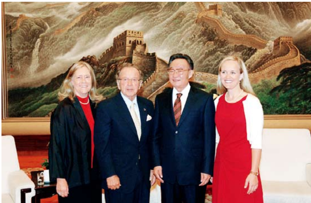
Wu Bangguo, chairman of the NPC Standing Committee, meets with Mr. and Mrs. Stevens in Great Hall of the People in June, 2010.

F ormer US Senator Ted Stevens, who was the Senate President Pro Tempore, died on the evening of August 9, 2010 when a small plane crashed in a remote mountain area of Alaska, killing all the nine passengers on board. Both the American and Chinese people lost a senior statesman and long-time friend. NPC Standing Committee Chairman Wu Bangguo, vice-chairmen Lu Yongxiang and Sheng Huaren, sent telegrams to Mrs Stevens to express their heartfelt condolence and sincere sympathy.