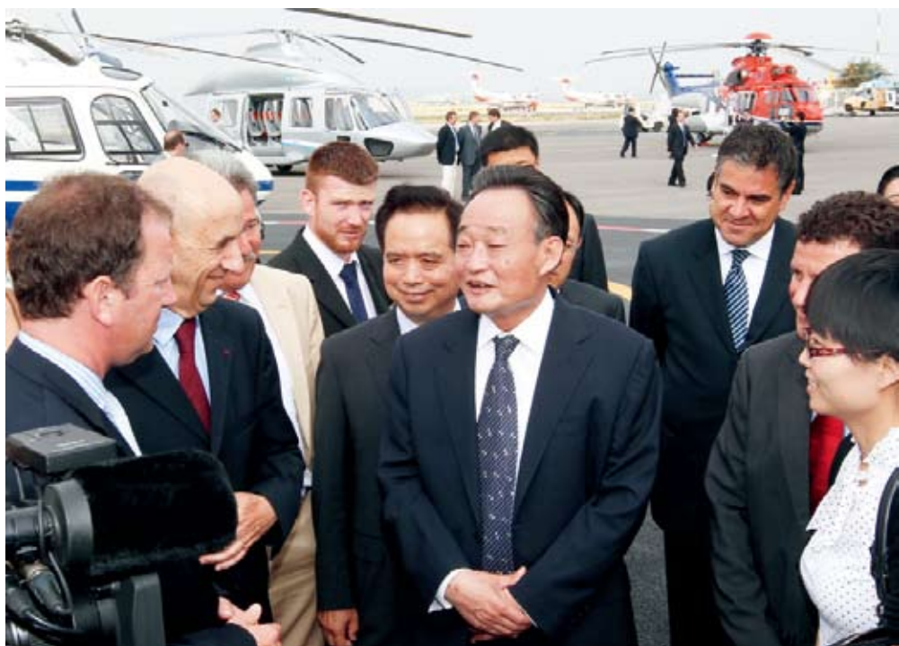
Wu Bangguo, chairman of the NPC Standing Committee of NPC, visits EuroHelicopter in Marseille on July 13 during his friendship visit to France.

Wu stressed that the international community has to honor its commitment to the goals, which is vital to safeguard people's dignity, equality and fairness. It is an issue on top of the agenda while the world strives for common development. However, it became a