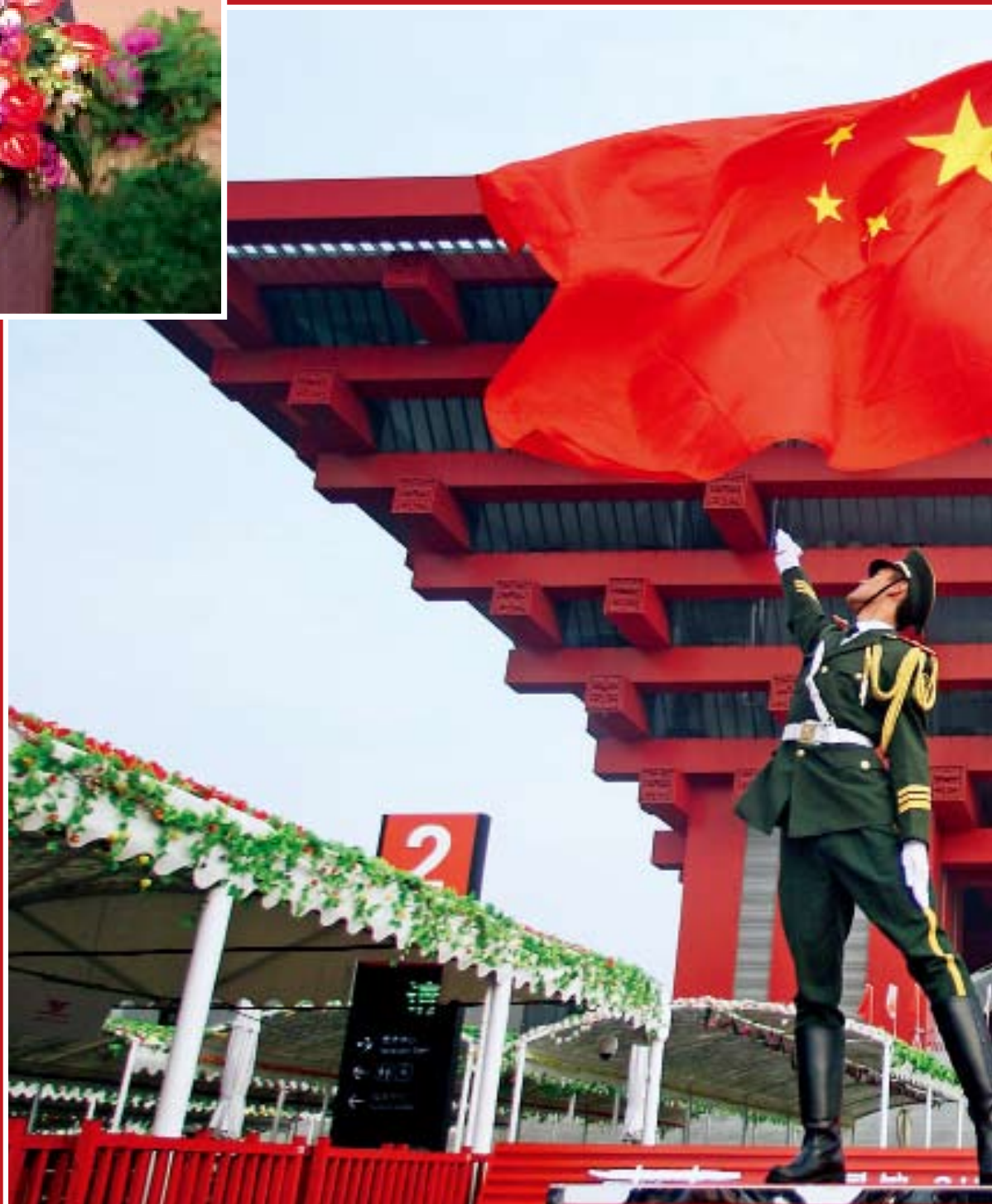
On October 1, a national flag-raising ceremony is held at the Shanghai Expo to mark the China National Pavilion Day.

During the Shanghai Expo 2010, visitors have the opportunity to appreciate the well-known Chinese painting The Riverside Scenes at Qingming Festival . The dynamic version of the picture is 130 meters long and 6.3 meters high, 30 times of its original. Designed by modern multimedia technics, the dynamic picture varies with change of lights and movements of figures. Xu Jiajun