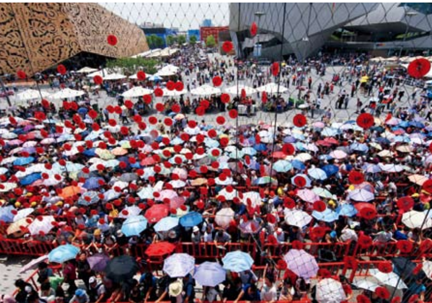
Numerous visitors wait in line to enter pavilions at Shanghai Expo.

The Shanghai Declaration, which set out targets for building cities that establish harmony between diverse cultures, between development and environment and between cultural legacies and