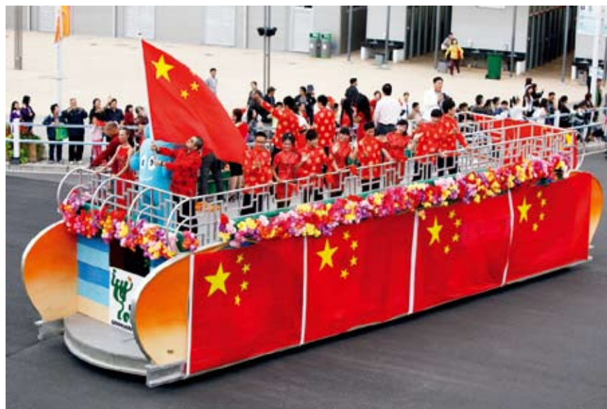
To celebrate the China National Pavilion Day as well as the National Day, the Shanghai Expo holds a float parade on October 1, 2010.

Wu thought high of the Yunnan Pavilion, which was his first stop of his tour at the Shanghai Expo site after he and his wife left the China Pavilion. Young women in traditional ethnic costumes from Yunnan greeted the couple and the other guests and presented them with traditional sachets, which stand for good luck, peace and health. The top legislator, along with other guests, then admired items and relics on display showcasing local ethnic cultures, including Bai ethnic residential building models, Dai ethnic gateway models and dinosaur fossils. "You've done a good job," Wu said when he and his wife greeted ethnic artists and the pavilion staff. He shook hands with them to show his appreciation for their hard work and took a group photograph