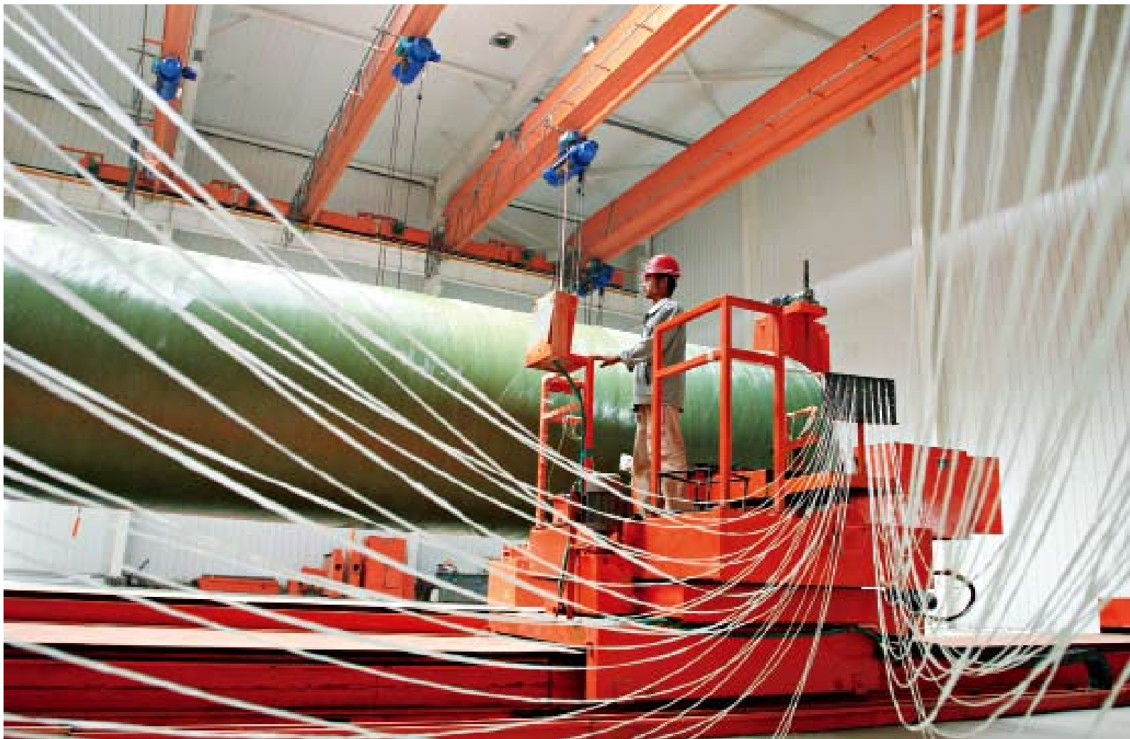
An employee works at a GRP pipeline workshop in Hami, Xinjiang Uygur Autonomous Region on June 22. A number of large-scale companies from other provinces and regions flood to invest into the region after the central government urged more partner aid toward Xinjiang.

Besides, the main consumers of resources are in eastern coastal regions, the reform of resource taxes in Xinjiang will help narrow the income gaps between the eastern and western regions. ■