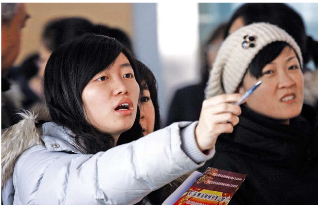
Law on Promotion of Employment prohibits prejudice and infringement on women's employment rights.

Employment is both the foundation of people's livelihood and a key issue for the stability of a State.