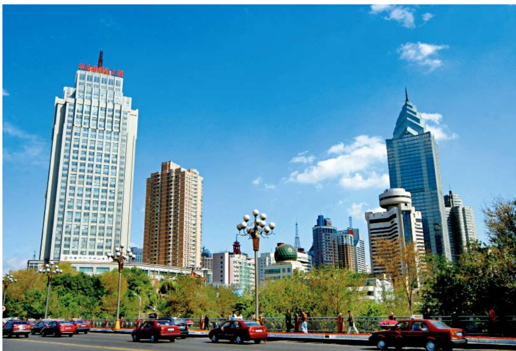
A bustling street in Urumqi, capital of Xinjiang Uygur Autonomous Region.

During his speech, President Hu pointed out that focal efforts will be made to ensure and improve the welfare of the people and speed up their living standards. Both the central government's investment and aid funds from supporting provinces are to be used in improving the living and working conditions of all ethnical groups. Increased income from the resources taxation reform will mainly used to improve the welfare of the people. Resources development should benefit directly to all ethnical groups in Xinjiang. Measures on implementation of anti-poverty policies on low-income families will be taken so that absolute poverty can be eradicated by 2020.