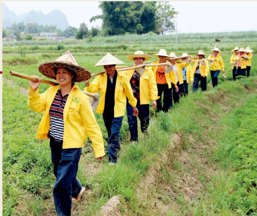
The promulgation of Law on the Mediation and Arbitration of Rural Land Contract Disputes indicates the improvement of the law system on rural land contracts. Zhang Ailin

The law stipulates that governments of village and township levels should strengthen their work in rural land contract dispute mediation, helping the involved parties to reach an agreement and