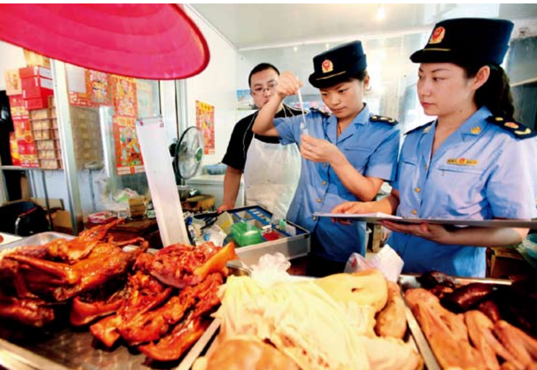
Officials from the bureau of industry and commerce in Huaibei, Anhui Province carry out a law inspection on food safety at a local market on June 30. Jin Mu

In China, the enactment of social insurance law concerns the adjustment of 1.3 billion people's vital rights and interests.