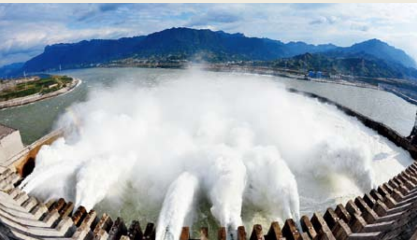
River water flows through the Three Gorges Dam, which was listed as one of the top 10 projects of renewable resources by the Scientific American magazine. Du Huaju

The Amendment to the Renewable Energy Law, passed in December last year at the 12th session of the Standing Committee of the 11th National People's Congress NPC, added stipulations of a central-planning system of the exploiting and using of various renewable energy resources, and will establish a national system to guarantee the procurement of renewable power generation. The amendment took effect on April 1 this year.