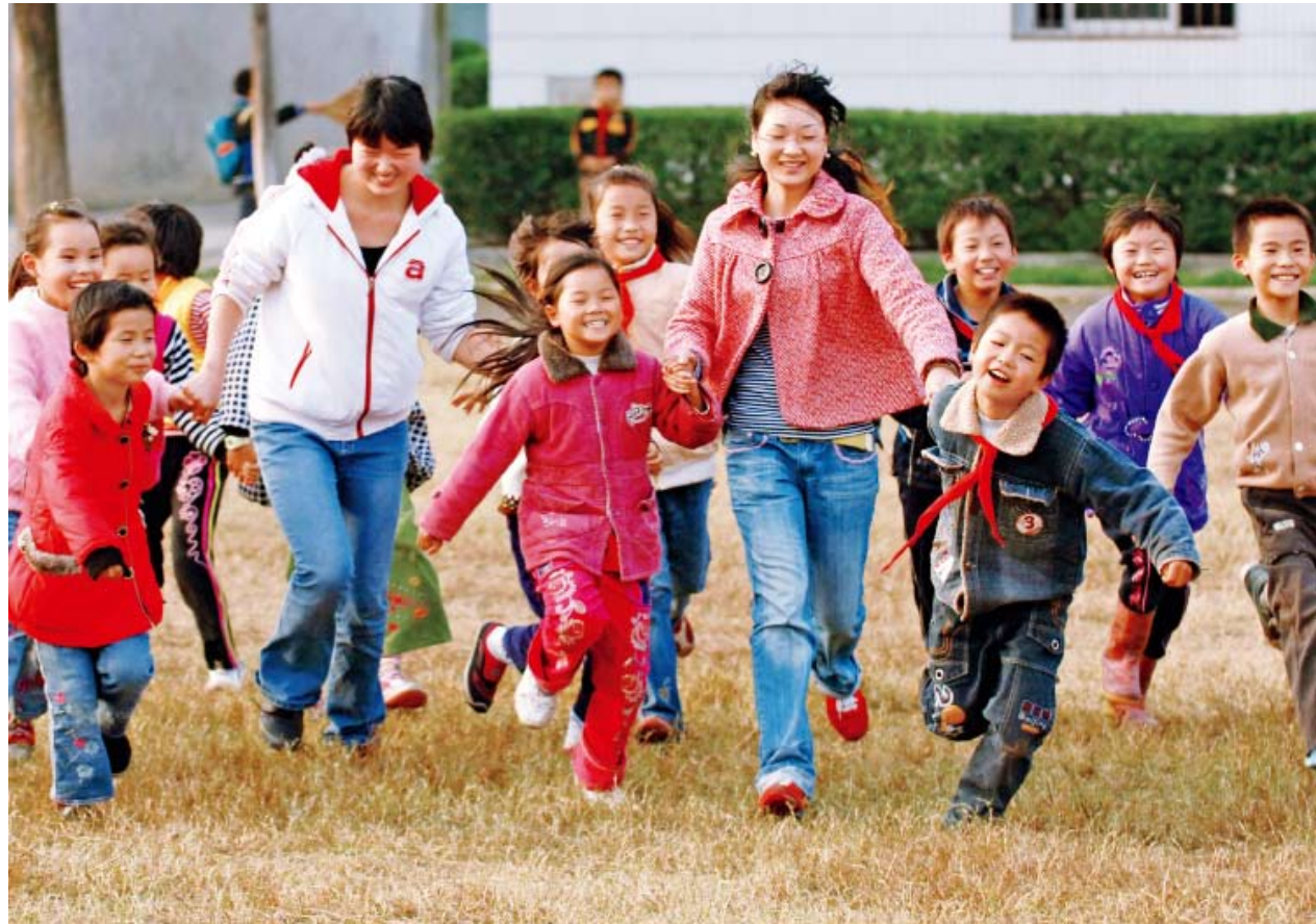
The amended Law on the Protection of Minors gets approved on December 29, 2006, which makes it clear that all-around legislative protection should be given to under-aged youngsters.

In 2004, the NPC Standing Committee summarized experience and lessons of dealing with SARS and bird flu in time, revised this law in an all-round way. The