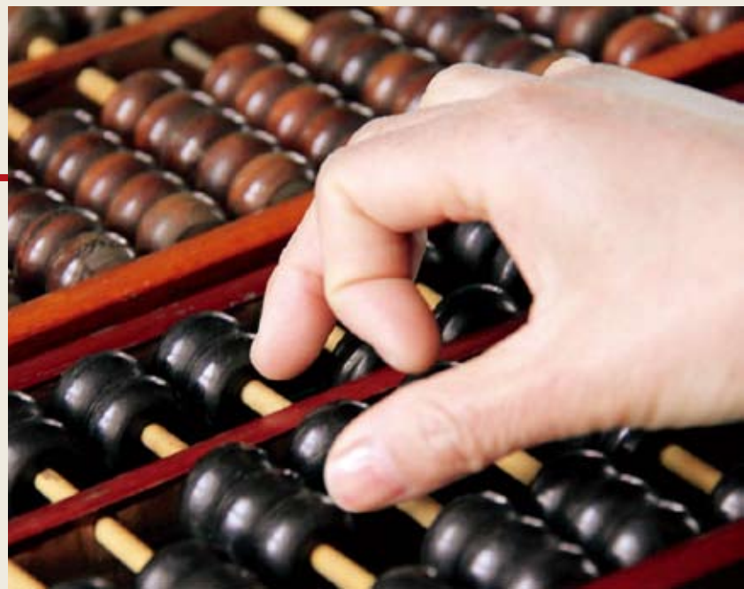
Abacus is the most-widely used computing tool before the appearance of Arabic numbers. Chinese people invented the tool more than 2,600 years ago.

To reduce the financial burdens of the rural people, the law also stipulates that the arbitrators should not charge any fees from the parties concerned. Expenses in arbitration work is included in government budget.