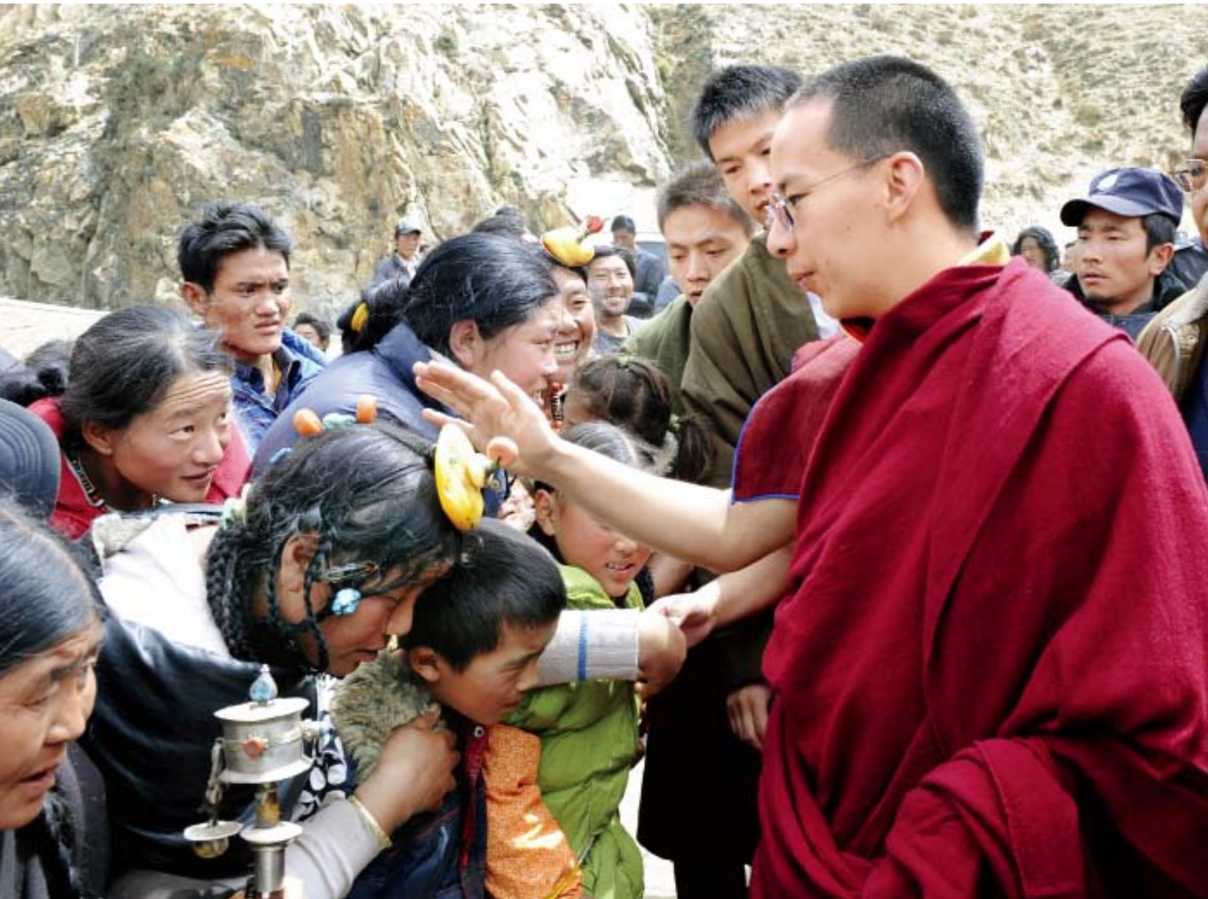
The 11th Panchen holds a religious assembly on May 14 to pray for the people died in the earthquake one month ago in Yushu, Qinghai Province. Li Xueren