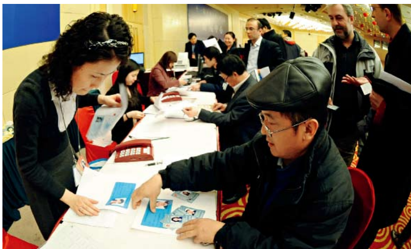
Work staff at the press center of the Two Sessions make interview permit cards for overseas reporters covering the event on March 2, 2009.