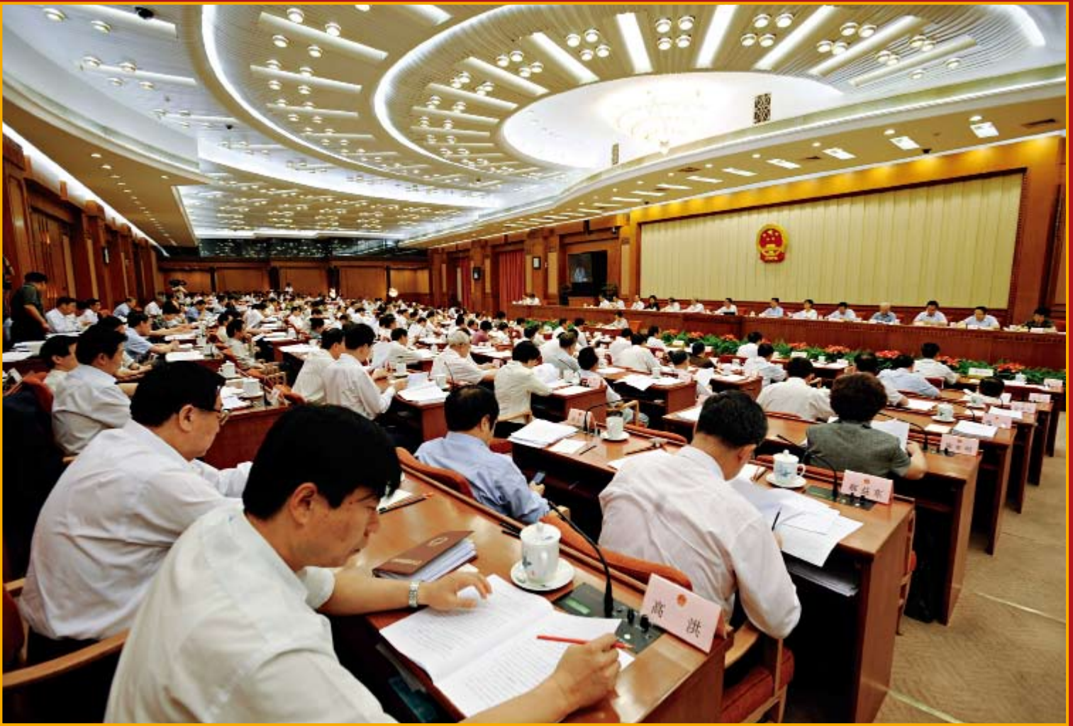
The 15th session of the 11th NPC Standing Committee is held on June 22-25, 2010 at the Great Hall of the People. Ma Zengke