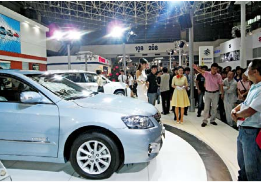
The 10th Xinjiang Auto Show opens at the Xinjiang International Exhibition Center in Urumqi on June 3.

The domestic and international opening-up policy in Xinjiang should be broadened at strategic level to make it a bridgehead of the western regions.