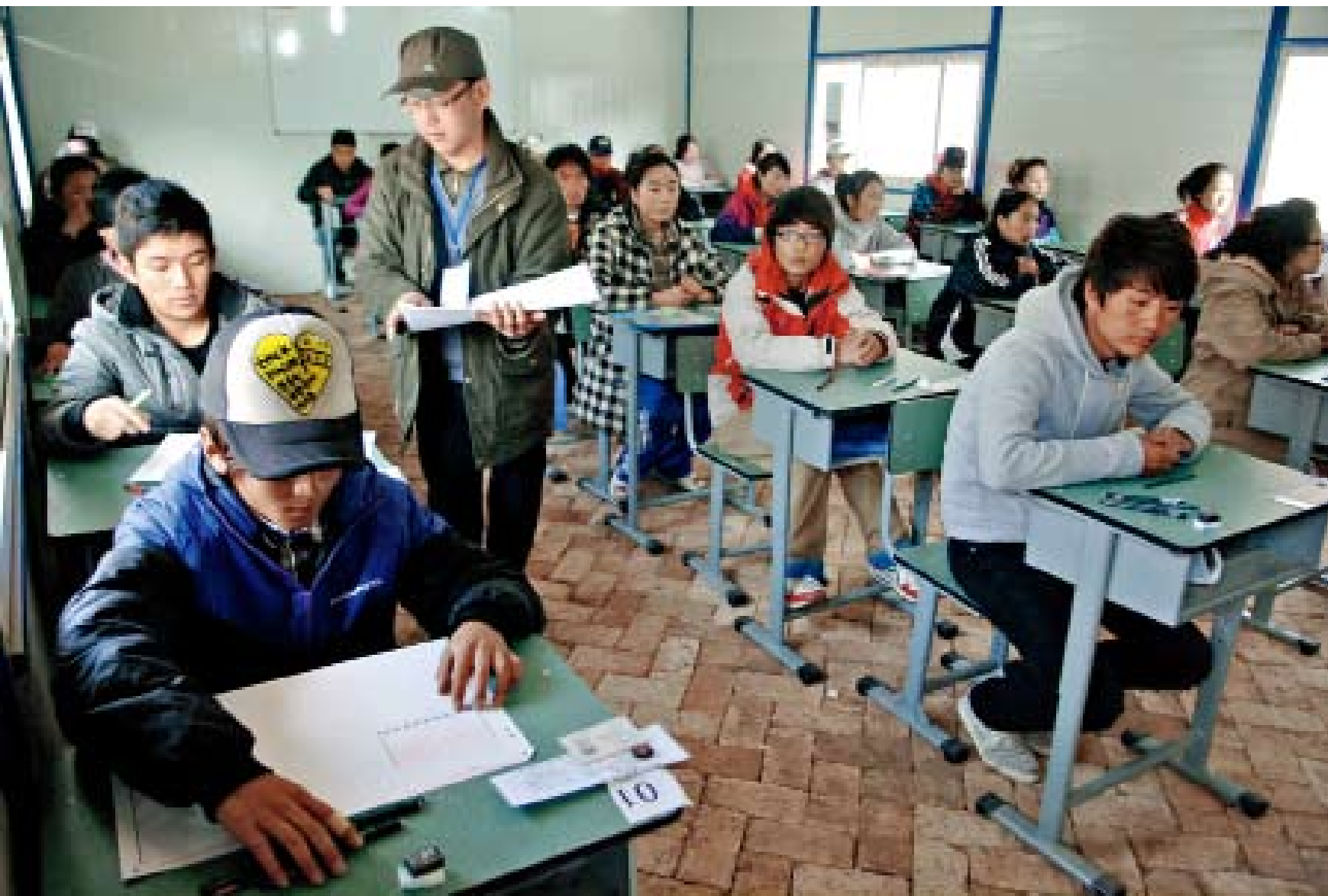
Teachers distribute answer sheets at an examination room in Gyegu Township, Yushu in Qinghai Province on June 7. More than 1,000 examinees participated in the national college entrance examination at makeshift rooms. Zhang Hongxiang

2,000 mountains that sits more than 5,000 meters above sea level with many cultural heritages, including the temple of Princess Wencheng, who is credited with making contributions to improve relations between Han and Tibetan ethnic groups during the Tang Dynasty (618- 907). However, some of the heritage sites were destroyed during the earthquake including the Gyegu Temple, the biggest Tibetan Buddhism temple in Yushu, with a history of more than 500 years.