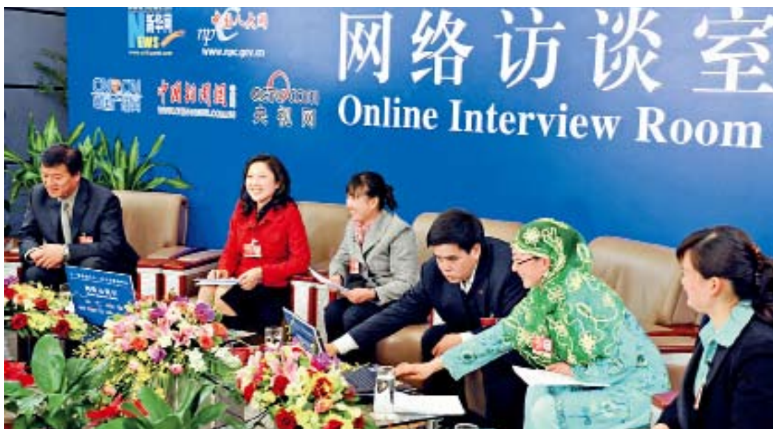
At the invitation of the press center of the 11th NPC Standing Committee 2nd Session, an online exchange is held between Internet users and six NPC delegates from grass-roots level, Xu Qiang, Zhu Xueqin, Hu Xiaoyan, Kang Houming, Bi Hongzhen and Wang Jing on the evening of March 10, 2009.

Meanwhile, we can see that, in course of opening-up, the NPC is playing its functions entrusted by the Constitution and reflecting the rule by the people in a better