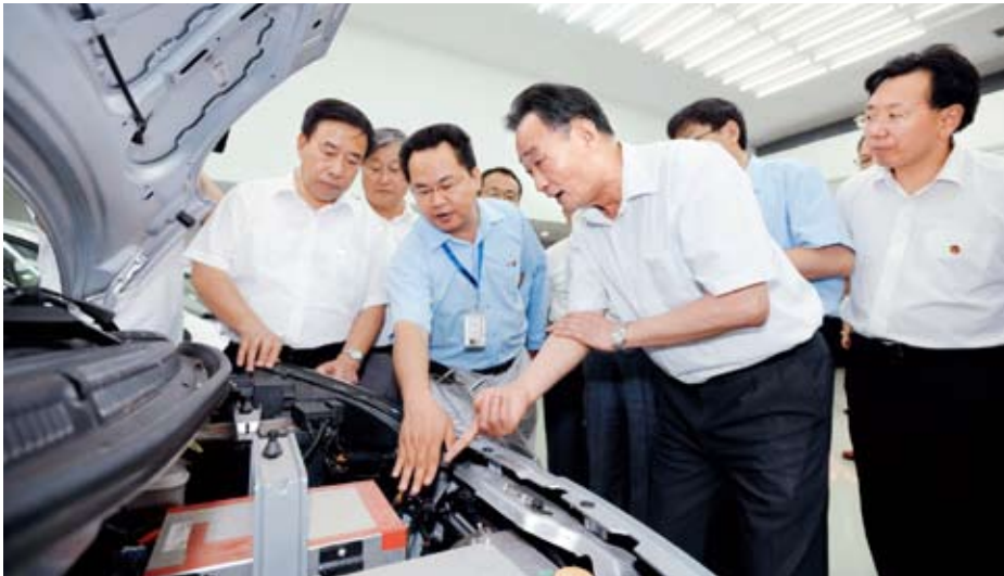
Wu Bangguo, chairman of the NPC Standing Committee, conducts an on-the-spot research in Anhui Province on July 2-7, 2009. The picture shows that Wu visited a new energy auto show at the auto research institute affiliated with the Chery Automobile Co., Ltd.

made some significant changes to the Law, including raising anti-earthquake standard of buildings, especially public institutions such as schools and hospitals. The revision also improved the earthquake emergency response system and optimized work in the relocation efforts and following reconstruction.