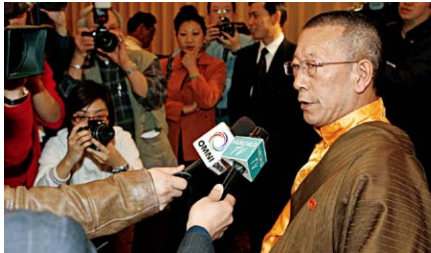
A people’s congress delegation from Tibet pays a visit to Canada in March 2009. On March 20, NPC deputy, Vice-Chairman of the Tibetan Autonomous Regional People’s Congress and Living Buddha Xinzha Danzengquzha answered questions of reporters in Toronto. Yuan Man