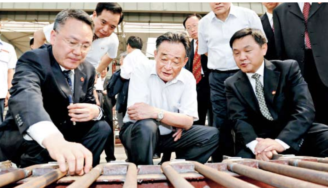
NPC Standing Committee Chairman Wu Bangguo pays a visit to Anhui Conch Cement Co., Ltd in July 2009.

posed by Internet friends. All participants were quite active and enthusiastic.