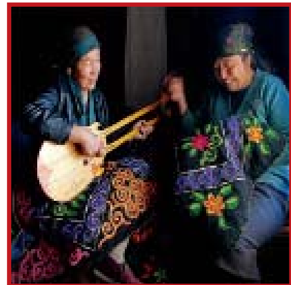
Natural scenery in Xinjiang Uyghur Autonomous Region and life of local people.