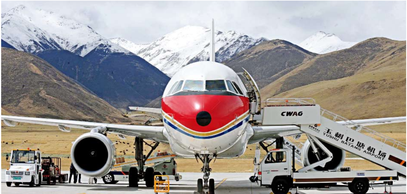
An airplane stays at the Batang Airport in earthquake-stricken Yushu on May 12, when the civil aviation was restored.