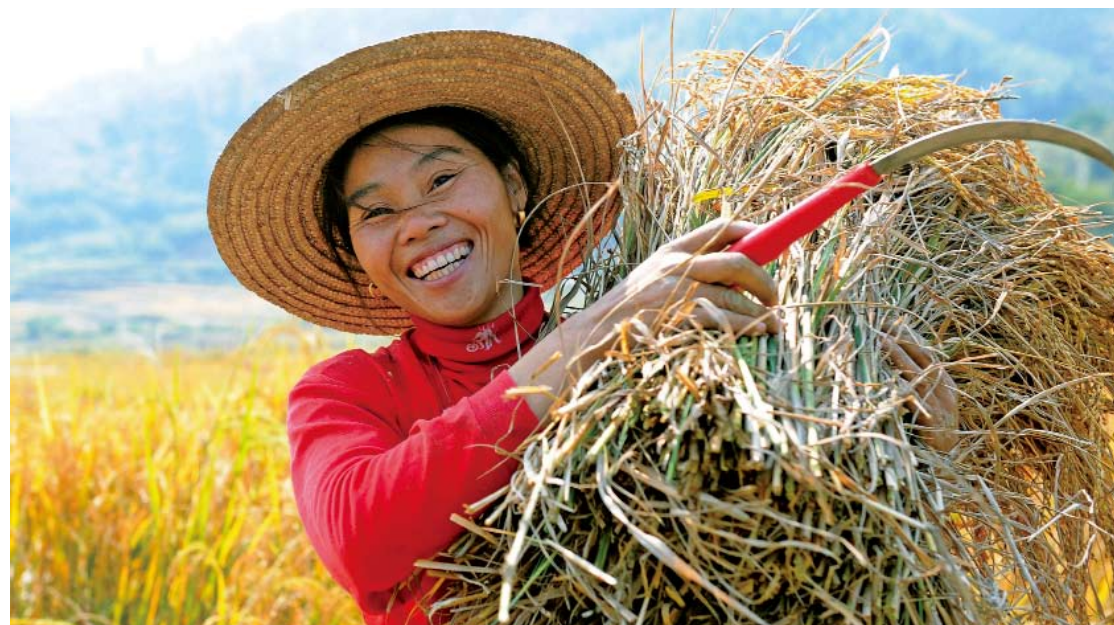
A woman farmer harvests rice in Guangxi Zhuang Autonomous Region. Liu Guangming

The Internal and Judicial Affairs Commission under the Standing Committee of the National People's Congress has analyzed and summarized the review by the six task forces and submitted a report to the Standing Committee and made further suggestions in a bid to solve some pressing issues. According to the report, the country needs to promote the awareness of gender equality as a national policy and take it as a guiding principle for various missions and further improve women's rights protection mechanism, including dispute settlement and a way to voice their concerns. ■