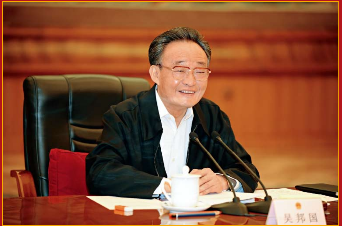
Wu Bangguo, chairman of the 11th NPC Standing Committee, chairs the 45th Chairmen's Council meeting of the committee at the Great Hall of the People on June 11, 2010. Ma Zengke