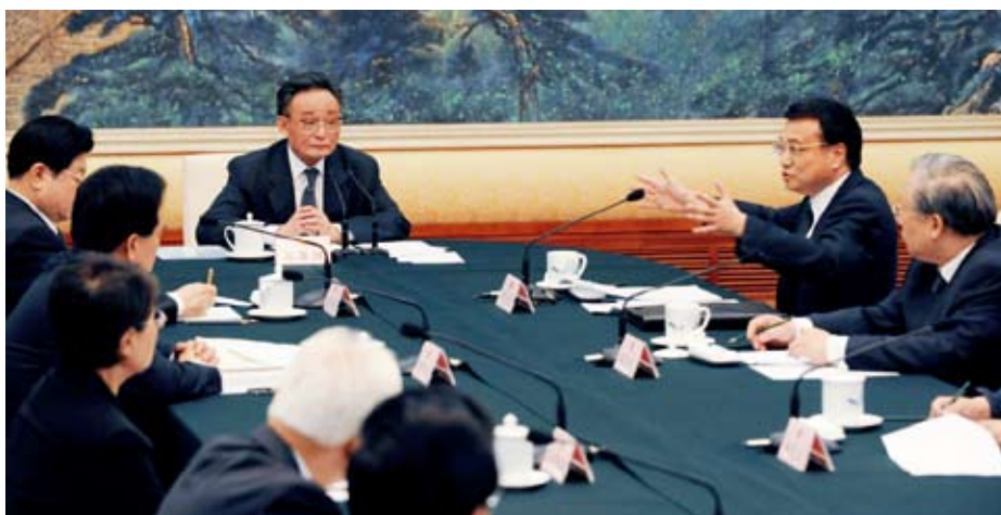
Vice-Premier Li Keqiang makes a report on earthquake rescue and relief in Wenchuan, Sichuan Province during the 4th Chairmen's Council meeting of the 11th NPC Standing Committee on May 22, 2008. NPC Standing Committee Chairman Wu Bangguo presided the meeting and made an important speech.