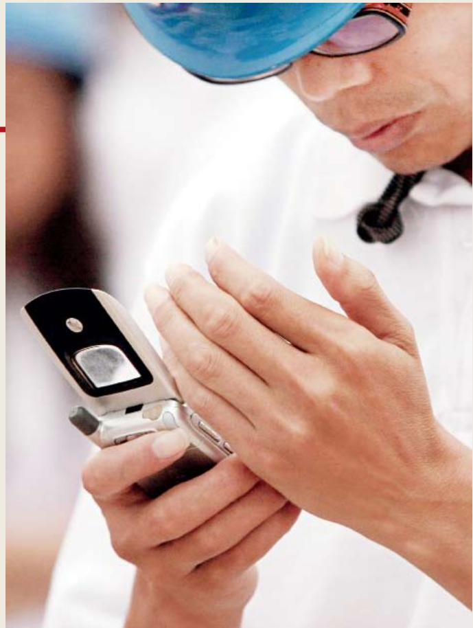
The promulgation of Tort Liability Law, which is regarded as a leap forward of Chinese legislation, aims to enhance the protection of personal privacy.

The Tort Law has special articles about medical malpractice