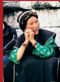
A Tibetan woman.