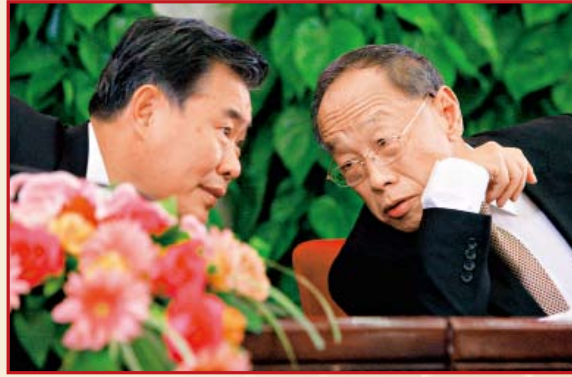
Li Zhaoxing, spokesman for the Second Session of the 11th National People's Congress (NPC), talks with Li Lianning, deputy secretary-general of the NPC Standing Committee during a press conference on the sideline of the Second Session of the 11th NPC in Beijing on March 4, 2009.