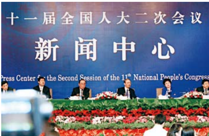
Commission for Legislative Affairs and Commission for Budgeting of NPC hold a group interview on legislative affairs and supervision of NPC on March 9, 2009.