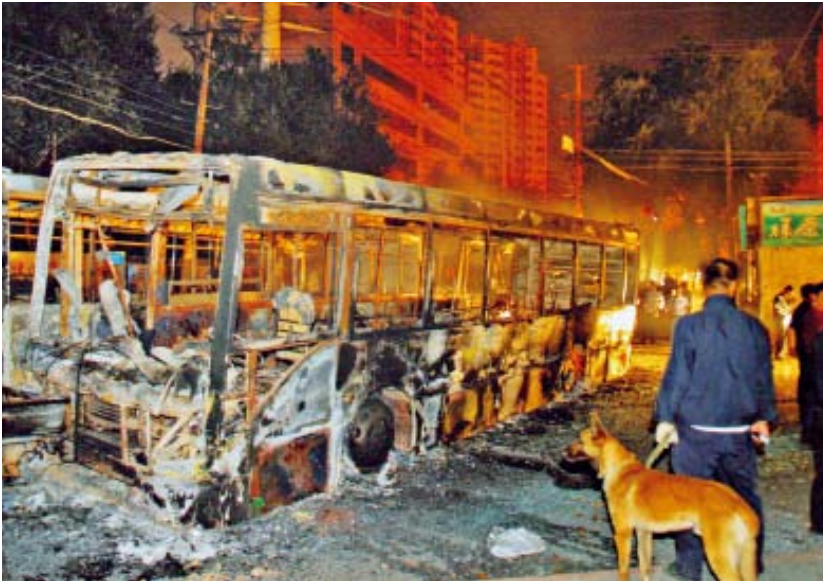
The scene of July 5 Urumqi riot

Any attempts to destroy ethnic unity and halt economic development would be smashed and doomed to failure.