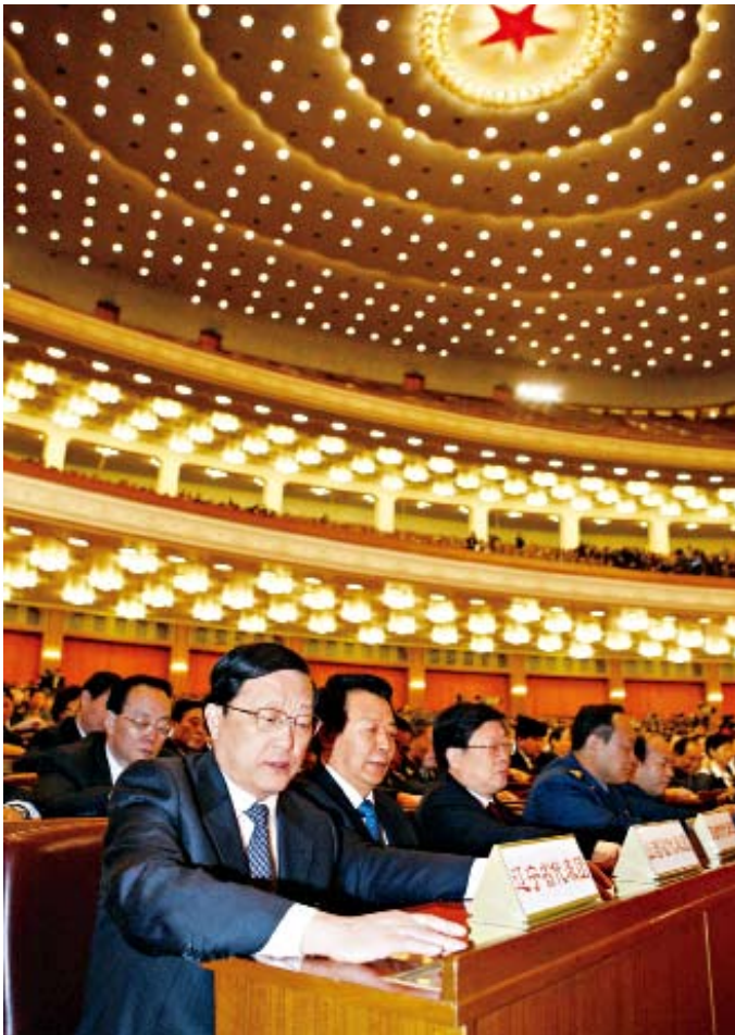
The Second Session of the 11th NPC concludes in Beijing, China's top legislature, approving a series of major policy decisions.

of oversight means, strengthen follow-up oversight, focus on key and difficult problems of common concern to the deputies, and urge the concerned parties to improve their work and set up a sound permanent mechanism for resolving these problems.