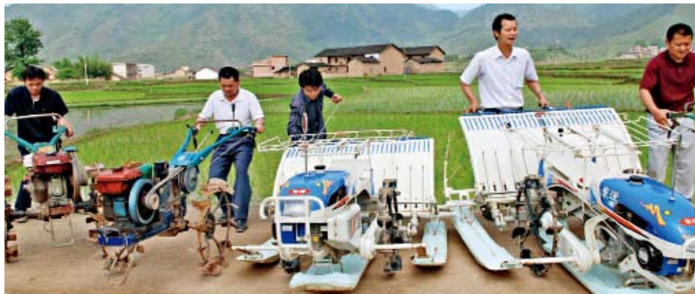
Farmers exhibit agricultural machineries in Fulong Village Xianhui Yao Ethnic Township, Zhaoping County of Guangxi Zhuang Autonomous Region on April 17, 2009.