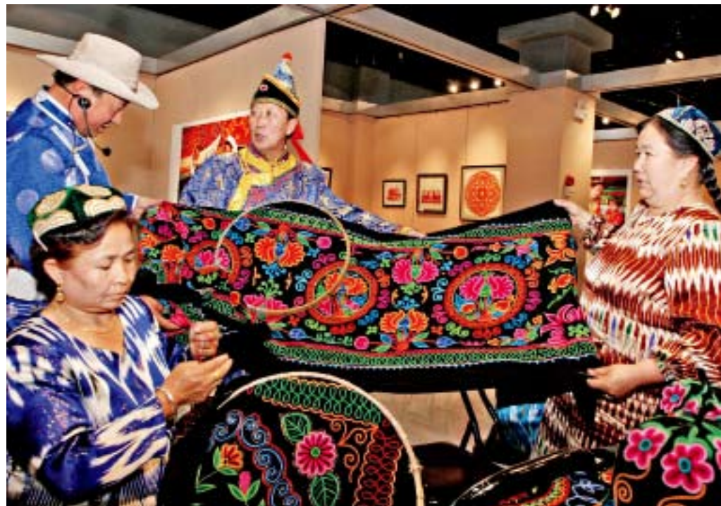
Xinjiang artisans show their hand-made embroidery.

Reporter from Associated Press of Pakistan: I have two queries also. First, like China, Pakistan faces similar problems in dealing with problems occurred in Xinjiang region. We all know that the July 5 incident was instigated by quite a small part of