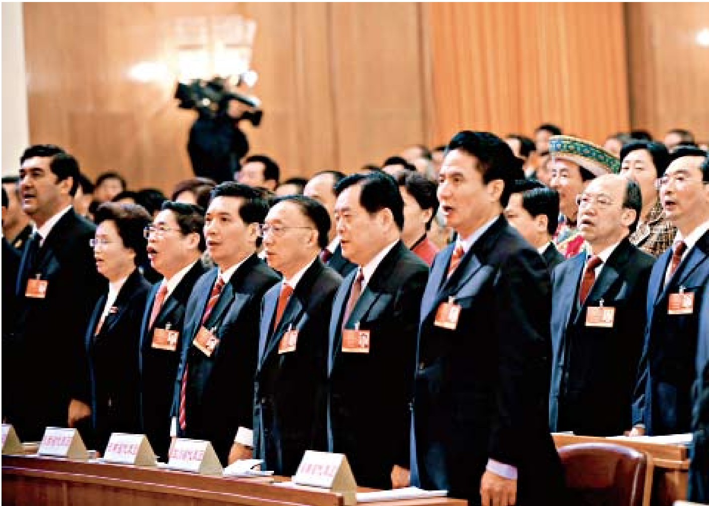
NPC deputies sing the national anthem as the Second Session of the 11th National People's Congress (NPC) opens in Beijing, March 5, 2009.

pointed out that we must maintain steady and rapid economic growth based on boosting domestic demand, promote sustainable development by accelerating transformation of the pattern of development and economic restructuring, make economic and social development stronger and more dynamic by deepening reform and opening up, intensify social development to speed up resolution of difficult and hotspot issues that bear on the interests of the people, and promote sound and rapid economic and social development and social harmony and stability. The Party Central Committee has made a number of major policy decisions and arrangements to accomplish these tasks and has called on all Party members and the people of all our ethnic groups to enhance their confidence in the face of difficulty and work hard together to constantly move forward the cause of socialism with Chinese characteristics. The top priority for the NPC Standing Committee's oversight work this year is to oversee implementation of the major policy decisions and arrangements of the Party Central Committee. We will fully implement the Law on Oversight, apply a combination of oversight means,