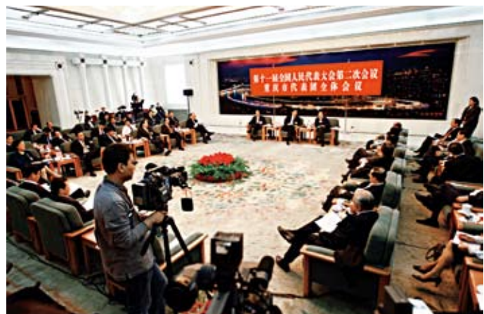
NPC deputies from Southwest China's Chongqing Municipality hold a panel discussion.