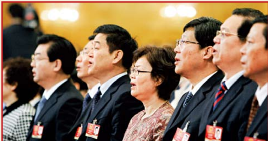
NPC deputies sing the national anthem as the Second Session of the 11th National People's Congress (NPC) opens at the Great Hall of the People in Beijing on March 5, 2009.