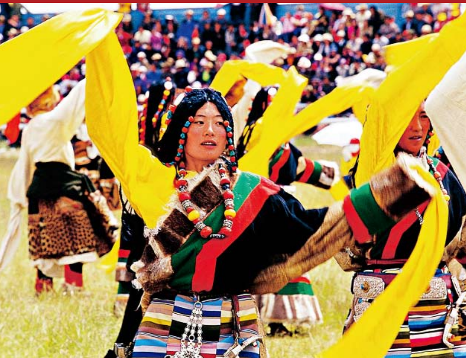
Dancing Tibetan girls.