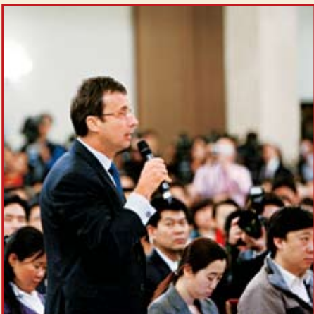
A journalist from Wall Street Journal asks questions during Premier Wen Jiabao's meeting with the press at the Great Hall of the People in Beijing on March 13, 2009.