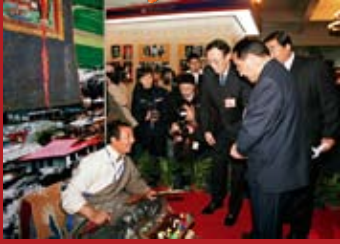
NPC deputies from Tibet, Qinghai, Gansu, Sichuan and Yunnan visit an exhibition to mark the 50th anniversary of democratic reform in Tibet on March 8, 2009.