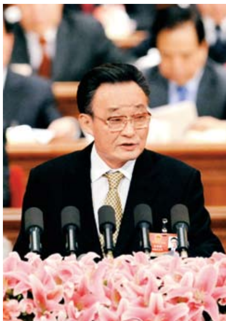
Wu Bangguo, chairman of the Standing Committee of the National People's Congress (NPC), delivers a report on the work of the NPC Standing Committee during the second plenary meeting of the Second Session of the 11th NPC in Beijing on March 9, 2009.

The year 2009 marks the 60th anniversary of the founding of New China and it will be a crucial year in terms of responding to the major challenges presented by changes in the international and domestic environments and developing all our country's undertakings. The general requirements for the work of the Standing Committee are as follows: We must faithfully follow the guiding principles of the Seventeenth Party Congress, the Third Plenary Session of the Seventeenth CPC Central Committee and the Central Economic Work Conference. We must take Deng Xiaoping Theory and the important thought of Three Represents as our guide and thoroughly apply the Scientific Outlook on Development. We must organically