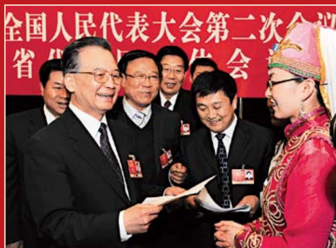
Premier Wen Jiabao joins NPC deputies from Northwest China's Gansu Province in Beijing on March 6, 2009.