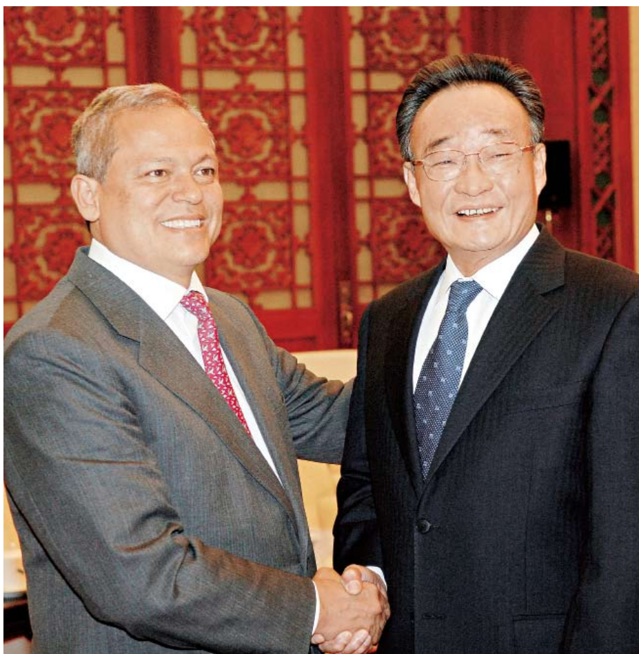
Wu Bangguo, chairman of the NPC Standing Committee of China, meets with visiting President of Colombian Congress Hernan Andrade Serrano on January 9, 2009.

Hernan Andrade Serrano, the president of both Colombian Congress and Colombian senate, has taken an active part in promoting bilateral exchanges and political understanding between Columbia and China since coming into power in July 2008. Invited by his Chinese counterpart Wu Bangguo, chairman of the National People's Congress Standing Committee, he led a delegation to Beijing on January