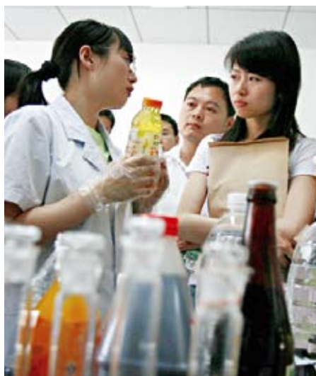
Visitors look around China National Food & Safety Supervision and Inspection Center in Haidian District, Beijing on May 19, 2009.

T he State Council is busy drafting a detailed rule for the new Food Safety Law to ensure its implementation from June 1, a senior legislator said