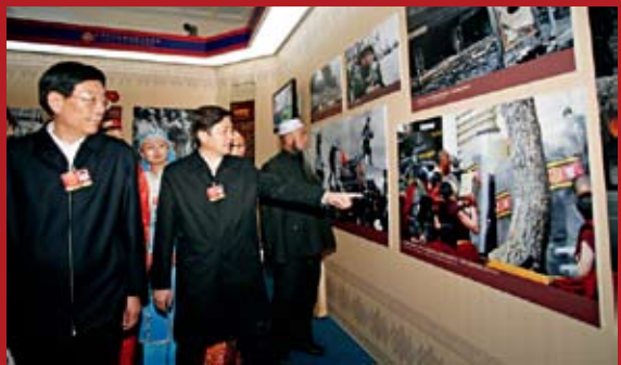
NPC deputies visit a photo exhibition marking the 50th anniversary of democratic reform in Tibet.