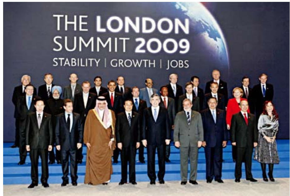
Leaders to the G20 summit pose for a group photo. Chinese President Hu Jintao (4th from left, 1st row) and British Prime Minister Gordon Brown (Center, 1st row) attended the summit, which was kicked off on April 2, 2009 in London.

There is a rise of protectionism that has been occurring in the course of the last 12 months that is taking many different forms. There is conventional protectionism, which is raising barriers, tariff or non-tariff, on the import of goods, agricultural goods or manufactured goods. There is financial protectionism – which is to block overseas investments or to discourage national banks from lending to foreign clients. This is taking place in a significant way in Europe for example. Then there is the protectionism that emanates from stimulus plans.