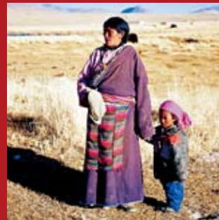
A Tibetan woman and her child.