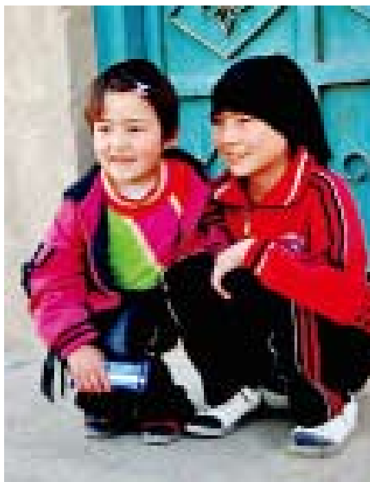
Two Uygur girls

Under the arrangement of the Central Government, Xinjiang's future is promising – its people will be more united and its economy and culture more prosperous.