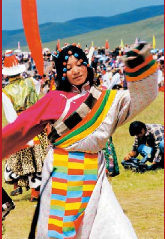
A dancing Tibetan girl.