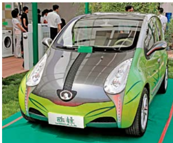
Electric-powered GW KULLA displays at Beijing Energy-saving & Environmental Protection Exhibition on June 14, 2009.

In US President Barack Obama's massive stimulus plan launched last month, he hailed the construction of new energy industries as the key to creating more jobs