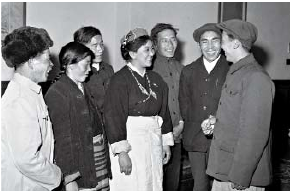
Seven slaves turned NPC deputies are excited after they have heard the government work report delivered by the then Premier Zhou EnLai, on December 26, 1964.

The legislative organs also promulgated regulations on the protection of forest, mineral resources and wild animals with the aim to protect, develop and use local resources according to the region's demand. A total of 17 national and regional natural reserves have been set up in Tibet, accounting one third area of the region. Such regulations play an effective role in protecting the fragile ecological environment on the "Roof of the World" and maintaining a sustainable development.