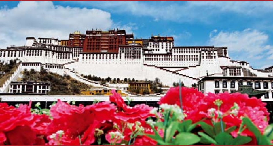
The Potala Palace in Lhasa of Tibet.