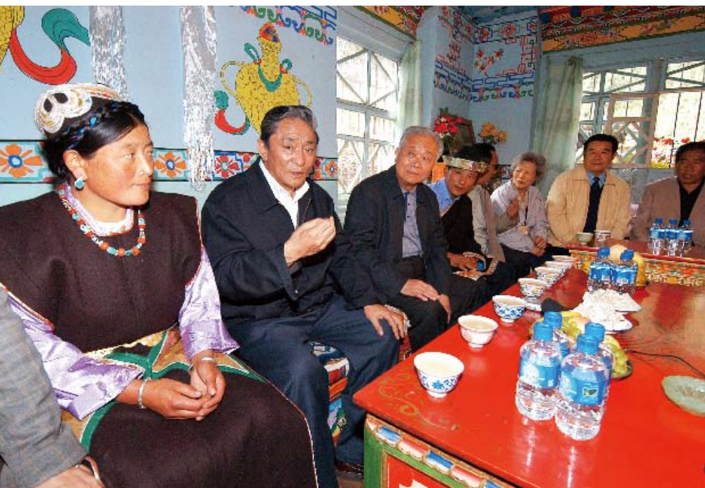
A NPC Standing Committee panel, headed by vice-chairmen of the 10th NPC Standing Committee Raidi and Sheng Huaren, inspected Tibet on August 4-11, 2007. Ma Zengke

Raidi said the people’s congress system is another foundation for the social and economic development in Tibet.