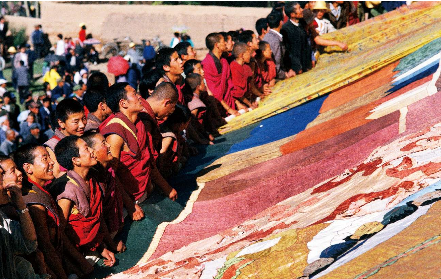
Buddha exhibition in a traditional Tibetan festival.

In Tibet, there were 81 environmental protection organizations at various levels in 2005, with the employment of around 380 staff. Also in 2005, results from tests showed that the water quality of