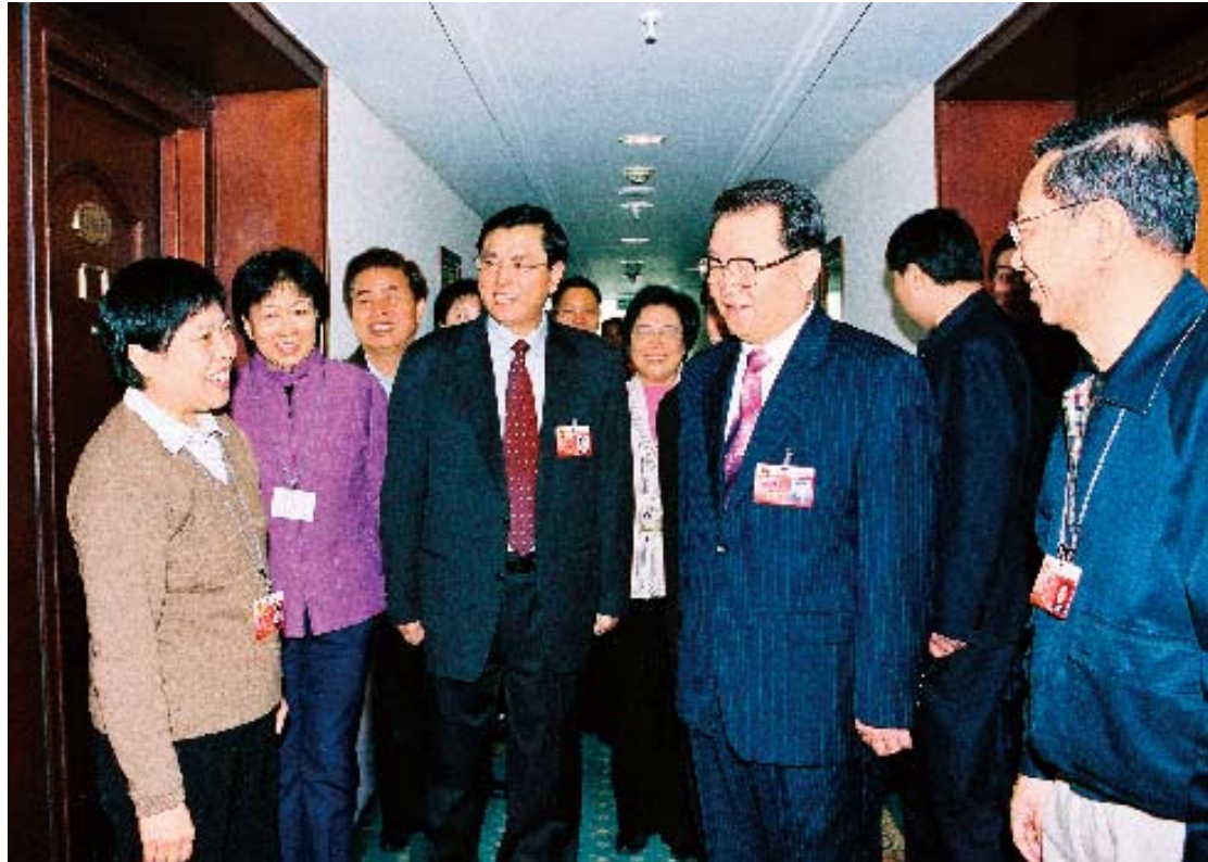
Li Changchun, a member of the Standing Committee of the Political Bureau of CPC Central Committee, meets with NPC deputies of Guangdong delegation. Li Jin

ishment of a task force to study regulations on housing and sending back vagrants and beggars. The State Council later recalled the regulation.