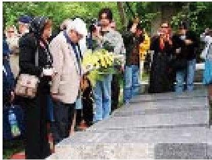
SEEKING ROOTS: About 100 Jewish visitors pray in front of their relatives' gravestones at Huangshan Cemetery, Harbin, in June

Although few Jews still reside in Harbin, the capital of Heilongjiang Province, many well-preserved architectures and commercial buildings constructed by the Jewish people nearly six decades ago, still remain as silent witnesses to their legacy.