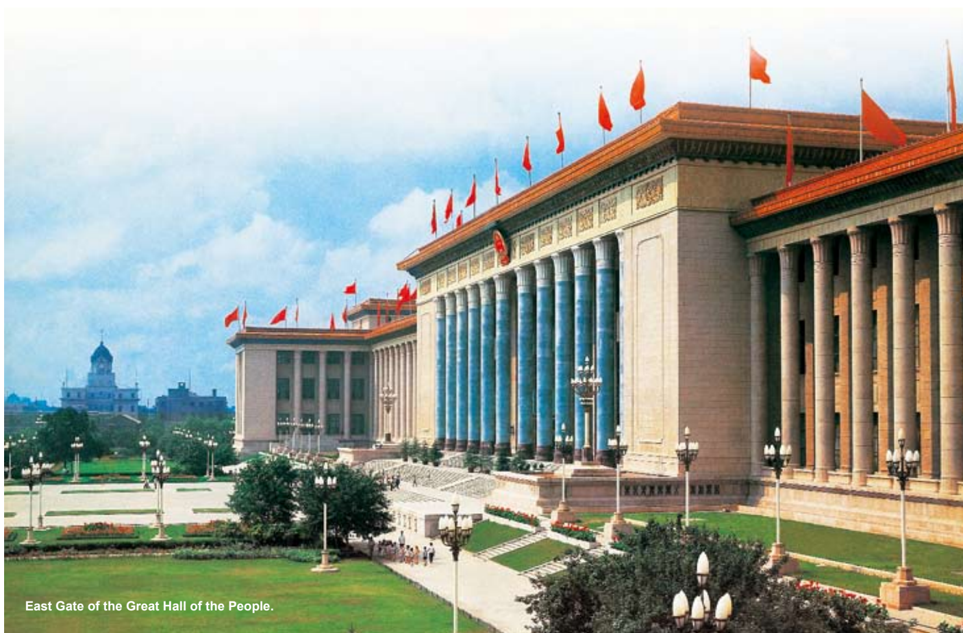
East Gate of the Great Hall of the People.

10 out of 17 national congresses were held in this sacred building. Every year, usually in March, the Great Hall of the People will host “two major conferences” – the annual sessions of the National People’s Congress (NPC) and of the Chinese Peo-