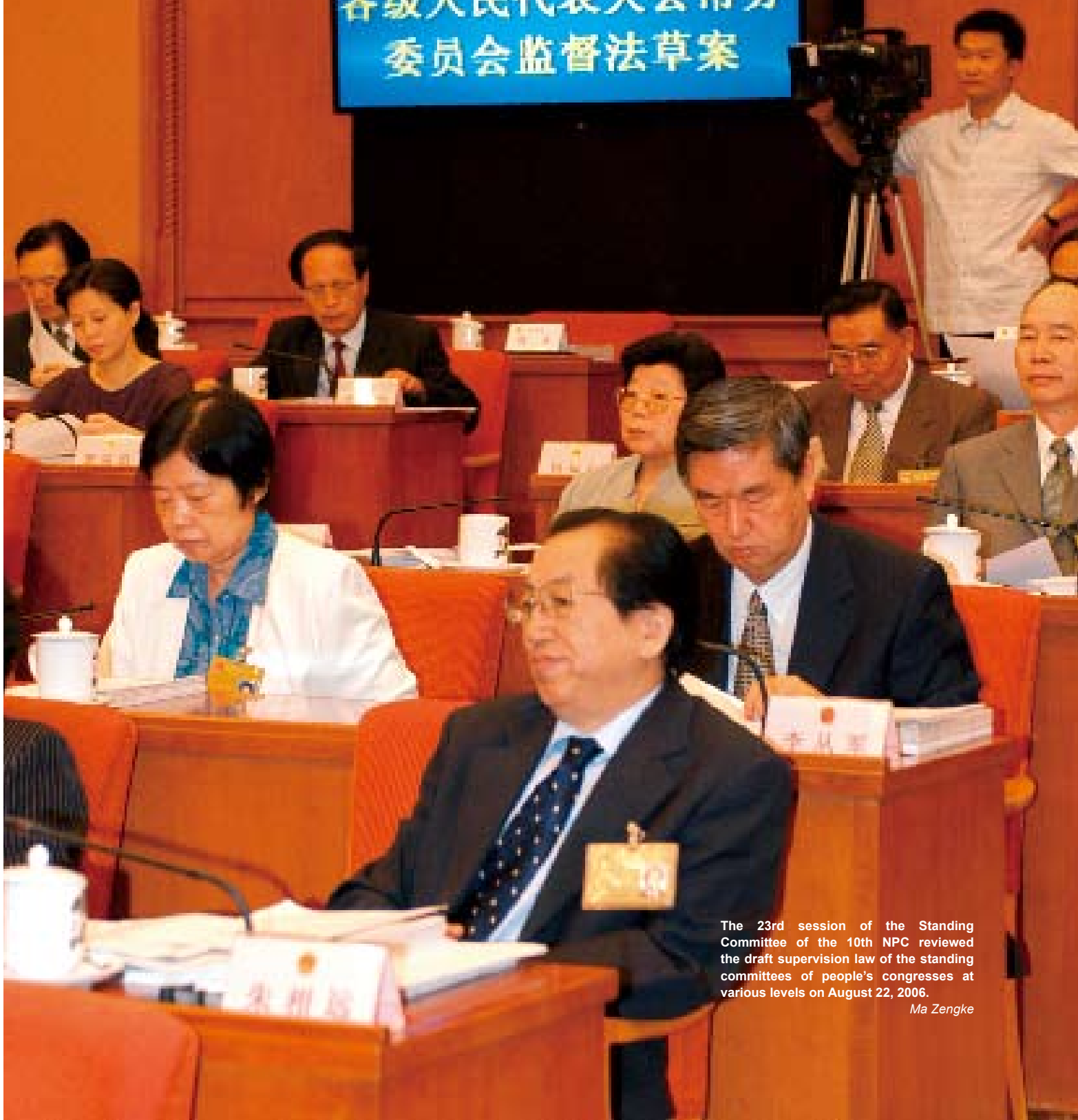
The 23rd session of the Standing Committee of the 10th NPC reviewed the draft supervision law of the standing committees of people's congresses at various levels on August 22, 2006.