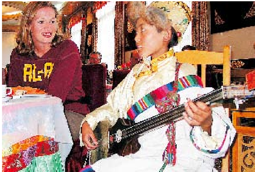
Many foreigners enjoy a summer tour to Tibet.

Many donations are channeled through the New York-based Tibet Fund, set up in 1981 by Tibetan refugees and US citizens. It has grown into a multimillion-dollar organization that disburses $3 million each year to its various programs. Parts of