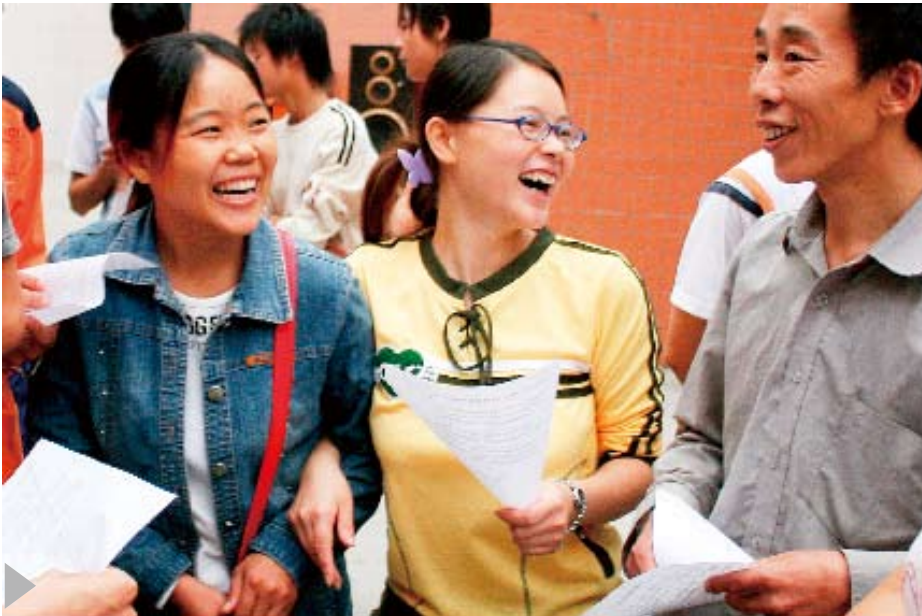
One hundred and sixty-seven students from the Lanyi School in Sichuan Province were glad to sign employment contracts with an electronic company in Guangdong on September 27, 2006. Qiu Haiying

be in favor of foreign investors because local governments have greater tolerance for them in order to attract and retain investment,” Xin said, adding that foreign companies must abide by the law just like their Chinese counterparts.