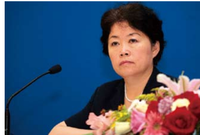
Xin Chunying, member of the NPC Standing Committee and vice chairwoman of the NPC Legislative Affairs Commission, attended a press conference on the adoption of the Labor Contract Law at the Great Hall of the People on June 29, 2007. She said that the law would not affect foreign enterprises' investment in China. Sheng Jiapeng

The NPC Standing Committee received 191,849 suggestions within 30 days.