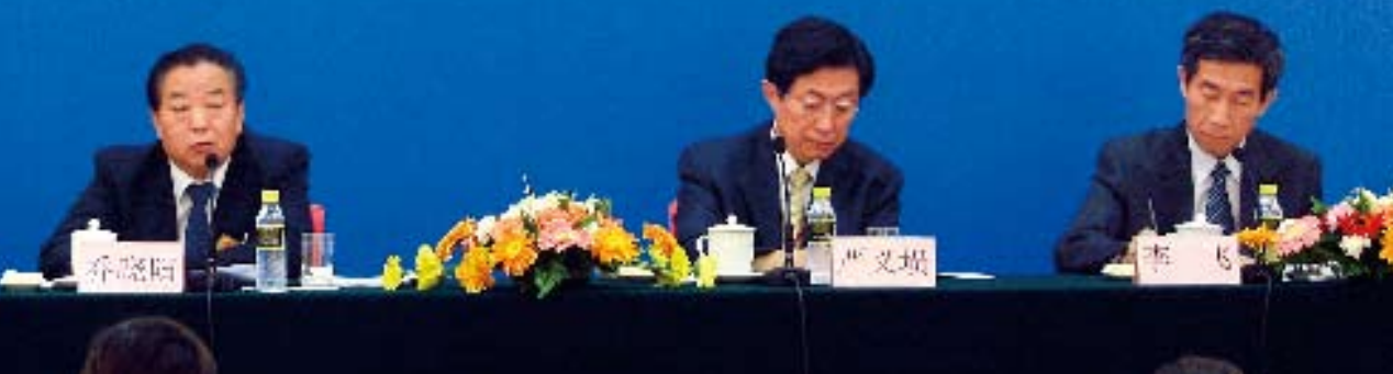
The General Office of the 10th NPC Standing Committee held a press conference on August 27, 2006 to brief reporters on three new laws, including the Supervision Law of the Standing Committees of People's Congresses at Various Levels.