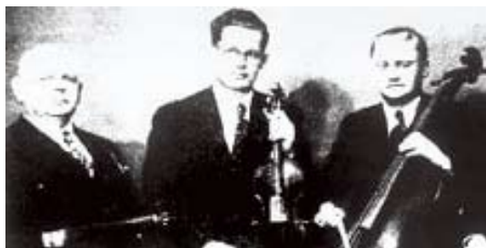
The Harbin Orchestra was composed mainly of Jewish musicians in the 1930s

"It was in Harbin that the generation of my parents began to fight for their dream of establishing a Jewish country," said Mr. Olmert, adding that, "the Jews in Harbin initiated the Zionist Movement, which sought to provide and maintain a national