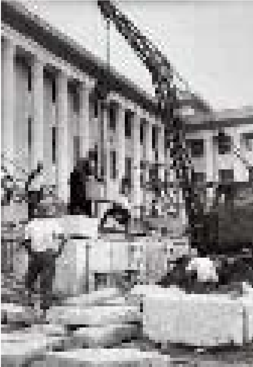
Construction workers installed granite slabstones at the East Gate of the Great Hall of the People.