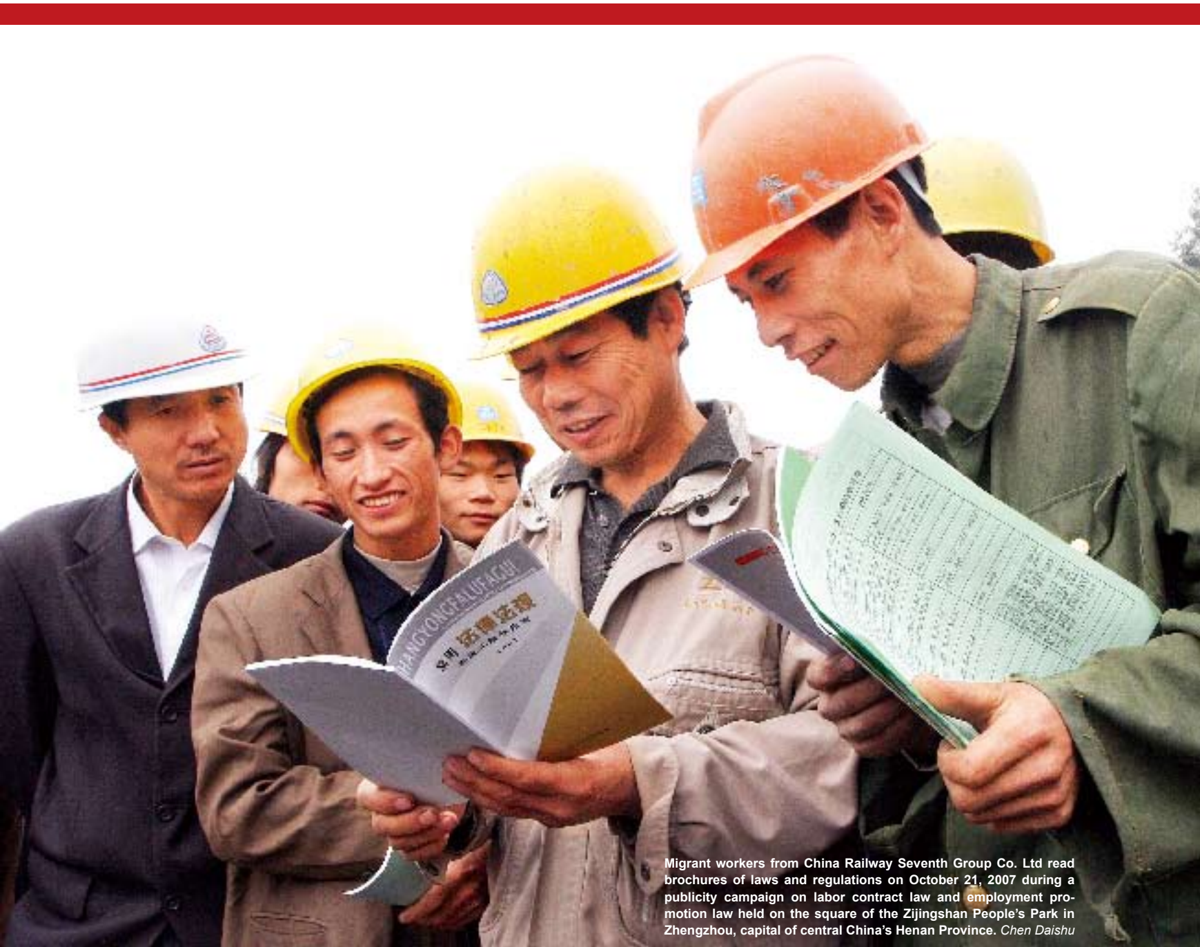
Migrant workers from China Railway Seventh Group Co. Ltd read brochures of laws and regulations on October 21, 2007 during a publicity campaign on labor contract law and employment promotion law held on the square of the Zijingshan People's Park in Zhengzhou, capital of central China's Henan Province.