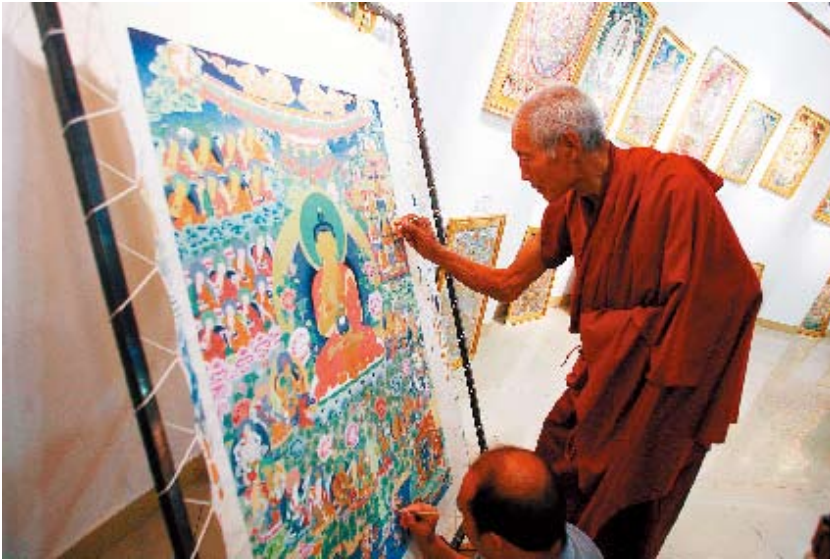
A senior Lama is drawing Thang-ga, a traditional Tibetan cloth painting.