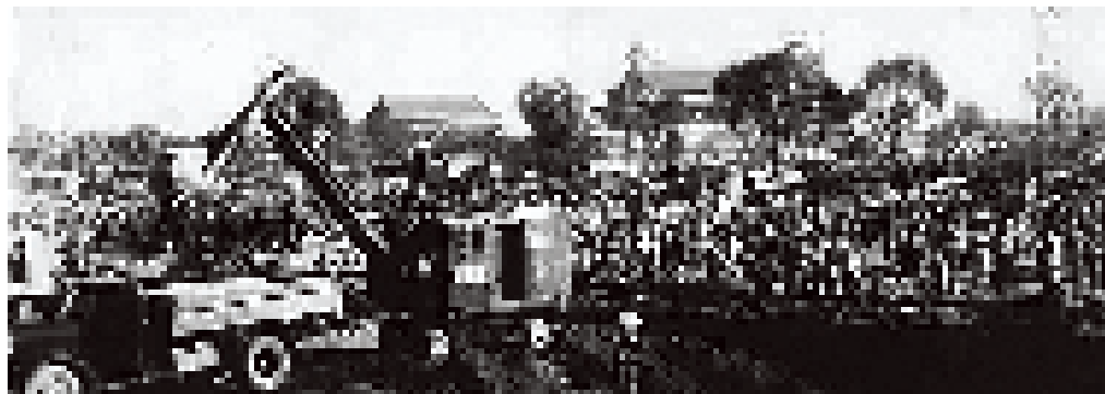
A busy building site of the Great Hall of the People.

the Great Hall of the People. If following traditional architectural concepts, it might be designed into a dull space with ceiling, floor and four walls linking together. At Premier Zhou's suggestions, the designers changed their original blueprint and turned the right angle of intersection between ceiling and walls into an arc angle. The ideal effect was achieved. When you enter the major conference hall, you will have a wide sphere of vision. The ceiling and the walls join together just as the sky and seas blend into one color.