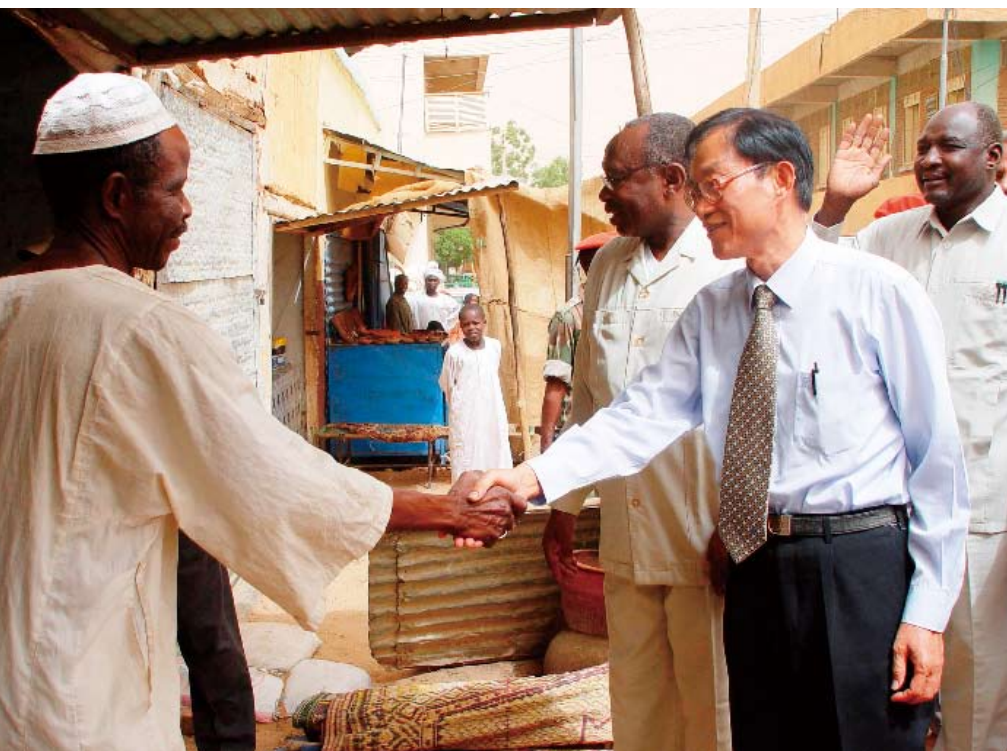
On May 22, 2007, Special Representative of the Chinese Government on Darfur Liu Guijin (right) was shaking hands and talking with a native in a market, which is located in the capital of North Darfur, El Fasher. On that day, Liu Guijin visited Darfur and investigated the situations by himself.

the resolution stipulates the AU-UN troops shall conduct the peacekeeping mission in Darfur without prejudicing the role of the Sudanese Government.