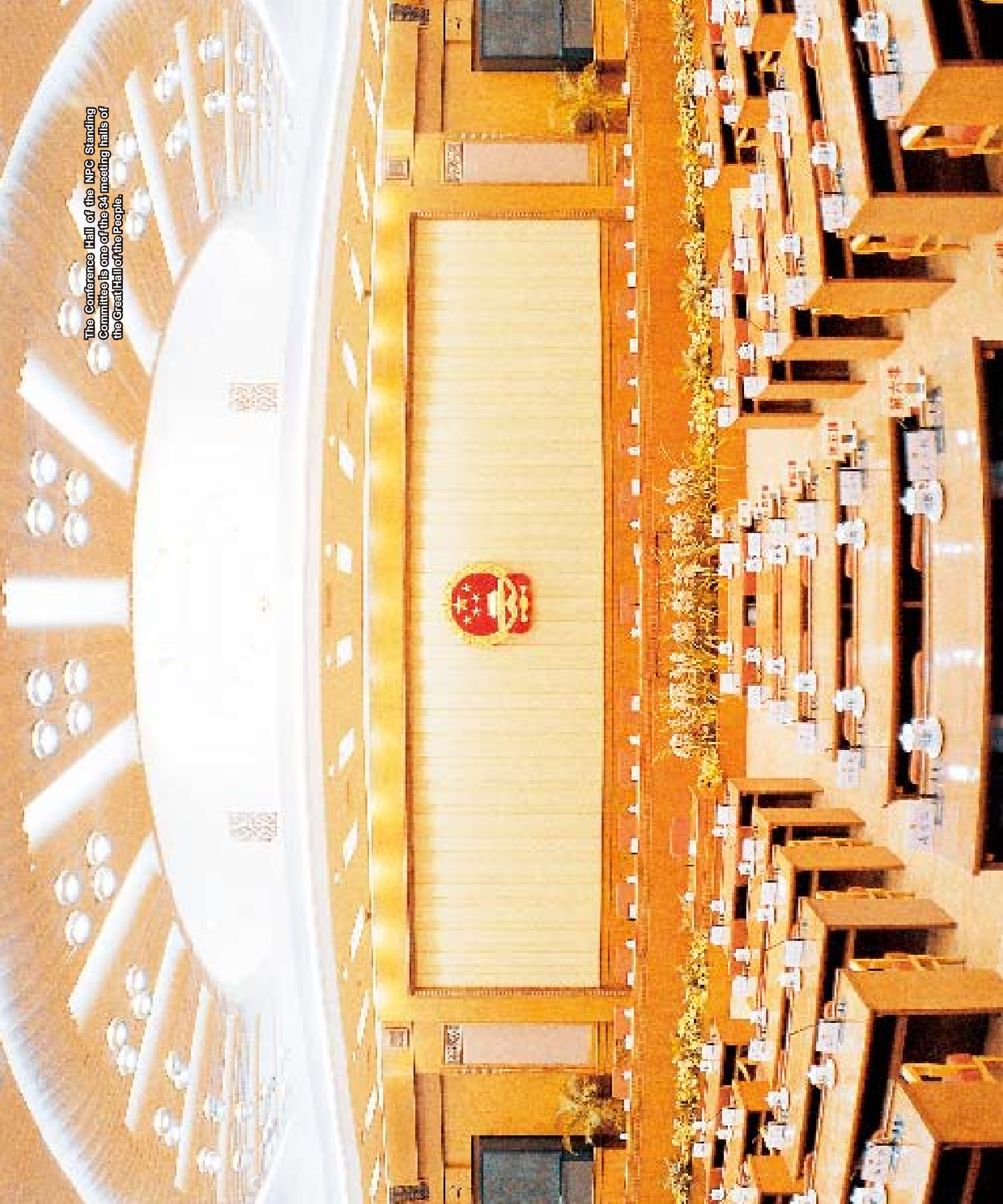
The Conference Hall of the NPC Standing Committee is one of the 34 meeting halls of the Great Hall of the People.