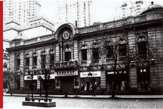
A.L. Okun Building, located in the middle of Central Street, is now used to house Women and Children's Department Store

“Harbin was a shelter for Jews who escaped oppression and prejudice in Russia. In this city, Jews enjoyed economic independence and established a colorful community life,” recollected the late journalist Israel Epstein (1915-2005), who was a Polish-born Chinese citizen and a member of the 10th National Committee of the Chinese People’s Political Consultative Conference.